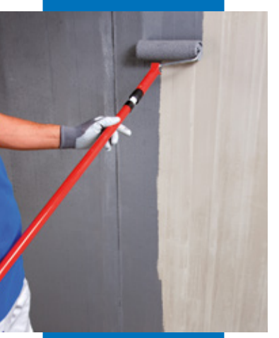
Application of Eco Prim Grip on concrete by roller