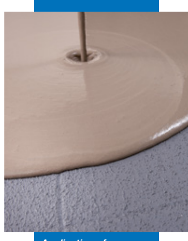
Application of Ultraplan self-levelling smoothing compound on dry Eco Prim Grip on old floor