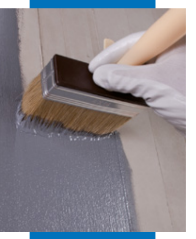
Application of Eco Prim Grip on concrete by brush