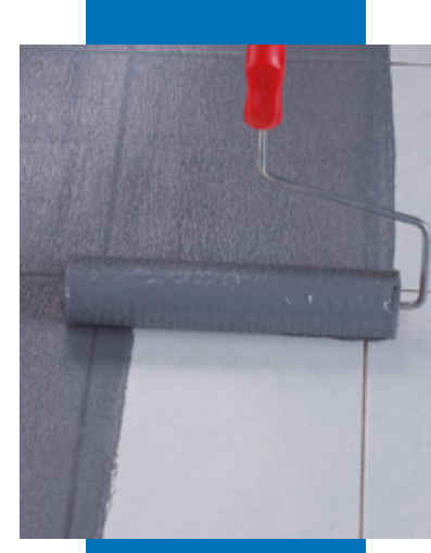
Application of Eco Prim Grip by roller on existing porcelain tiles