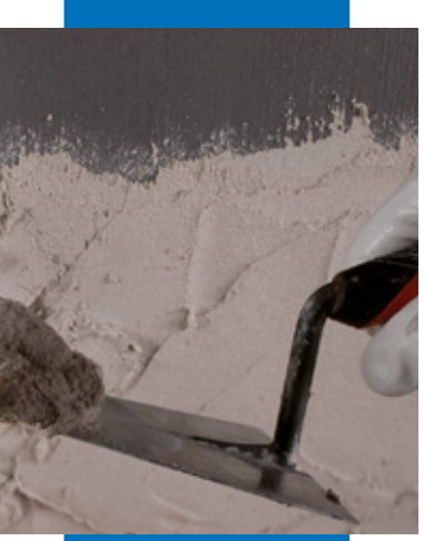
Application of render on Eco Prim Grip