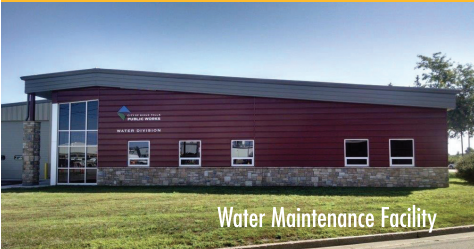
Water Maintenance Facility