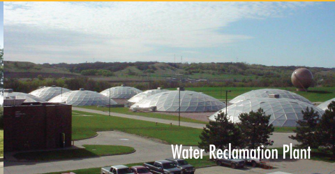
Water Reclamation Plant