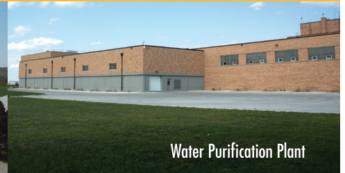
Water Purification Plant

We're working hard to provide a better quality of life for you.