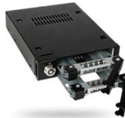
FLEX-FIT 5.25" to 3.5" Drive Bay Conversion Kit