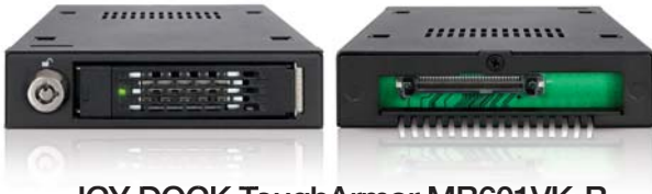
ICY DOCK ToughArmor MB601VK-B