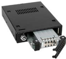
FLEX-FIT 5.25" to 3.5" Drive Bay Conversion Kit