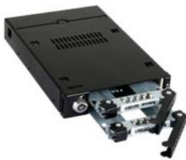
FLEX-FIT 5.25" to 3.5" Drive Bay Conversion Kit