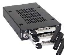
FLEX-FIT 5.25" to 3.5" Drive Bay Conversion Kit