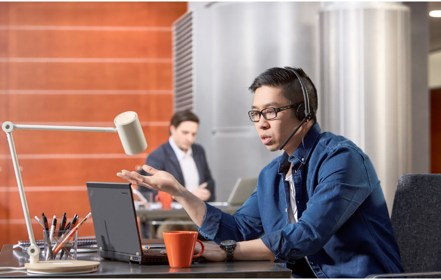
ABB Technical Support service answers your technical questions and provides you advanced product. The service relies on ABB's extensive drive expertise which you can reach through your local ABB.