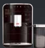
CAFFEO Barista® TS

Each Melitta® CAFFEO® model range has its own unique features. The table below helps you to get a quick overview.