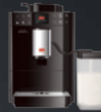
CAFFEO® Varianza® CSP