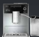
CAFFEO® Passione® OT

Each Melitta® CAFFEO® model range has its own unique features. The table below helps you to get a quick overview.