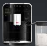
CAFFEO Barista® T