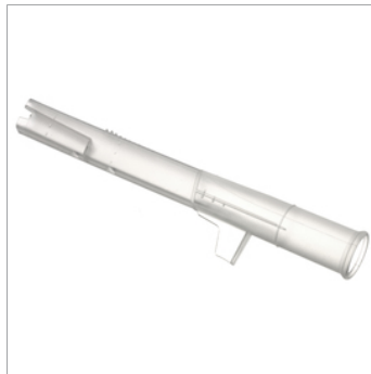
Mouthpieces (Slide 'n' Click)

Mouthpieces are supplied in a pack of 100.