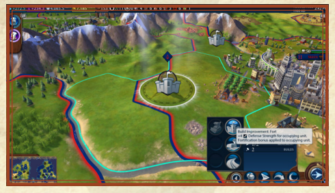
Build Fort: Construct a Fort improvement to provide combat defenses.