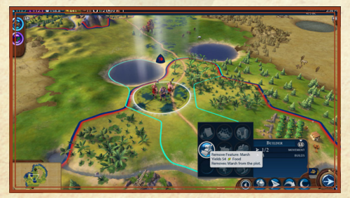
Remove Marsh: Order the Builder to clear the selected tile of any Marsh Feature.