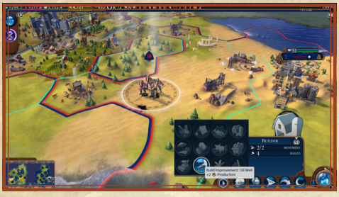
Build Oil Well: Construct an oil well on the current land tile to access the Oil resource there.