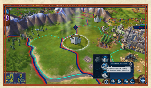
Build Airstrip: Construct an Airstrip improvement to provide Aircraft slots.