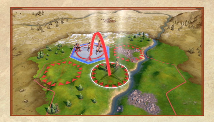
Range Attack: Perform a ranged attack on the selected tile.