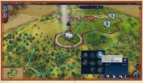
Build Pasture: Construct a Pasture on the occupied tile for resources like Horses and Cattle.