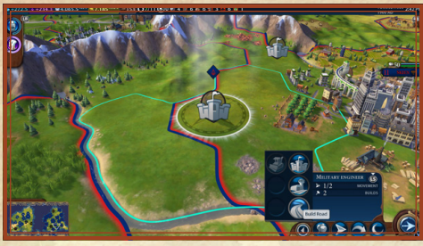
Build Road: Build a road improvement on the current tile. Roads can be built on any passable land tile.