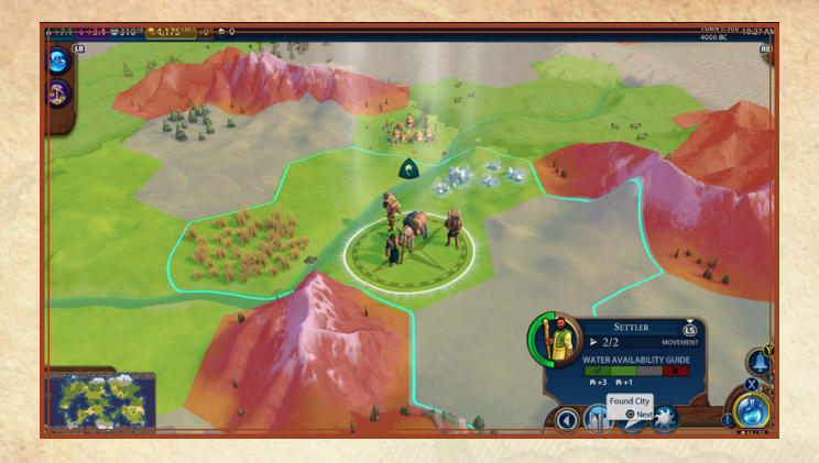
Found City: Order a settler unit to found a new city in the current tile. The Settler is consumed in the process.