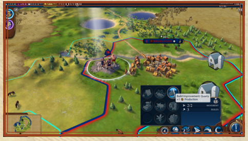
Build Quarry: Construct a Quarry on the current tile. Marble resources require Quarries to be built on them in order to be accessed.