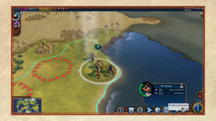
Fortify Until Healed: The unit remains inactive until it heals back to full strength. The unit receives a defensive bonus and heals every turn.