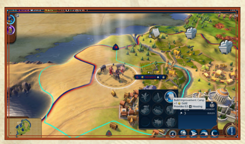
Build Camp: Construct a Camp on the occupied tile to access resources like Furs and Deer.