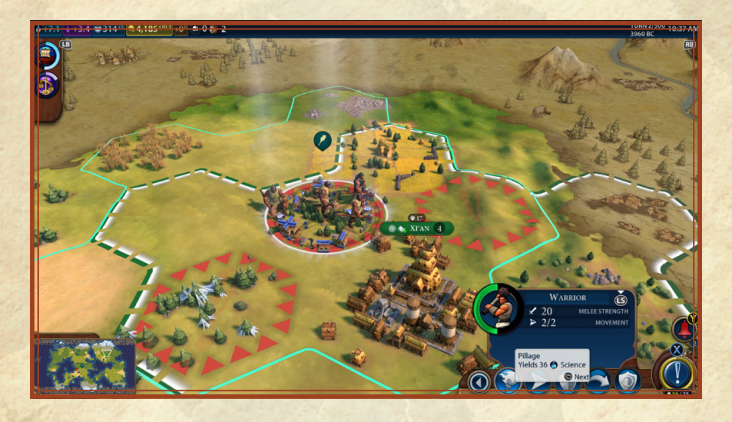
Pillage: Order the unit to destroy the improvement on the current tile. The improvement, road, or building must be repaired before it can be used again.