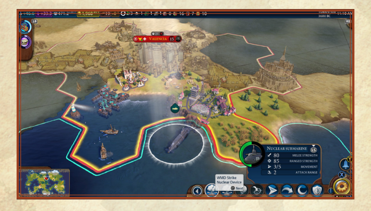
WMD Strike-Nuclear Weapon: Launches a nuclear weapon at the chosen tile. The target and all surrounding tiles in the radius of the weapon will receive massive damage.