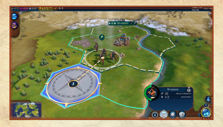
Sleep: Order the unit to remain inactive until the player provides it new orders. It will not become active again the next turn and must be manually selected.

Move to: Order the current unit to move to the selected tile.