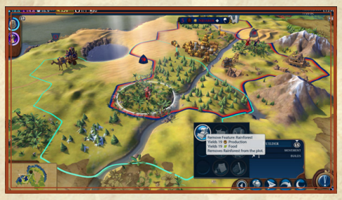
Remove Rainforest: Order the Builder to clear the occupied tile of its Rainforest Feature. This removes any benefits provided by the Rainforest.