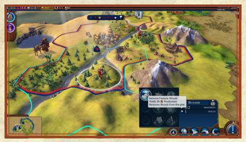
Remove Woods: Order the Builder to clear the occupied tile of any Woods Feature. This removes any benefits provided by the Woods.