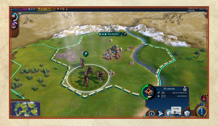
Fortify: The Unit remains inactive until the player provides it new orders. The unit receives a defensive bonus.