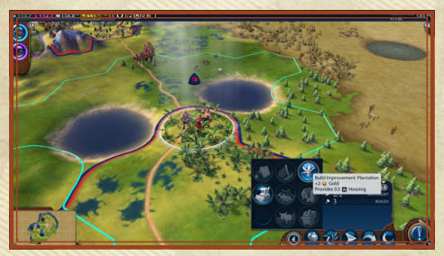
Build Plantation: Construct a Plantation on the current tile. Plantations are needed in order to access many Luxury Resources.