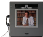
Polycom Judicial Wall Unit