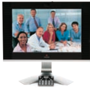
Polycom HDX 4000™