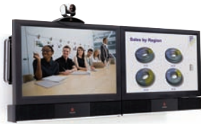
Polycom HDX 8000™