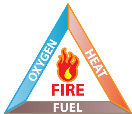
The “fire triangle” shows the three elements needed for a fire to occur: oxygen, heat and a fuel source.

Also important to note are the safety aspects of chemical blanketing. The technique holds the greatest safety sway in industries that use combustible, flammable or explosive materials. Blanketing prevents the materials from coming into contact with the oxygen in the air, and thereby creates a nonflammable environment. The explanation of this effect is simple. A fire requires three elements (often depicted with the common