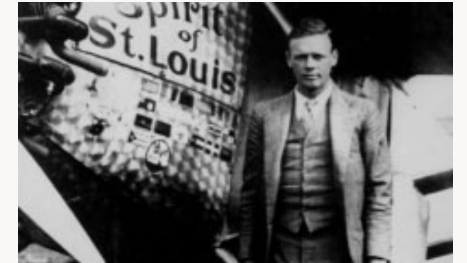
1927 saw the birth of the first Volvo car. It also marked the first solo flight across the Atlantic Ocean when Swedish descendant Charles Lindbergh and his Spirit of St. Louis captured the imagination of America. Now we would like you to imagine yourself on a flight (much more comfortable than Lindbergh's) to Europe to pick up your new car, compliments of Volvo.

Can you think of a better way of traveling overseas and making your souvenir part of an unforgettable experience?