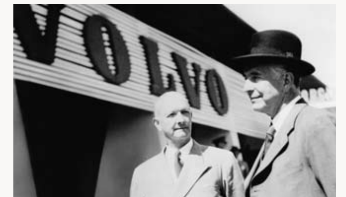
"... The guiding principle behind everything we make is and must remain, safety" (Assar Gabrielsson and Gustaf Larson, 1927). Our founders' vision set the cornerstone for what have become our core values: safety, quality and environmental care. Volvo is also committed to building cars that inspire people and make driving a pleasure. We strive not only to protect people, but to stir the souls within them.