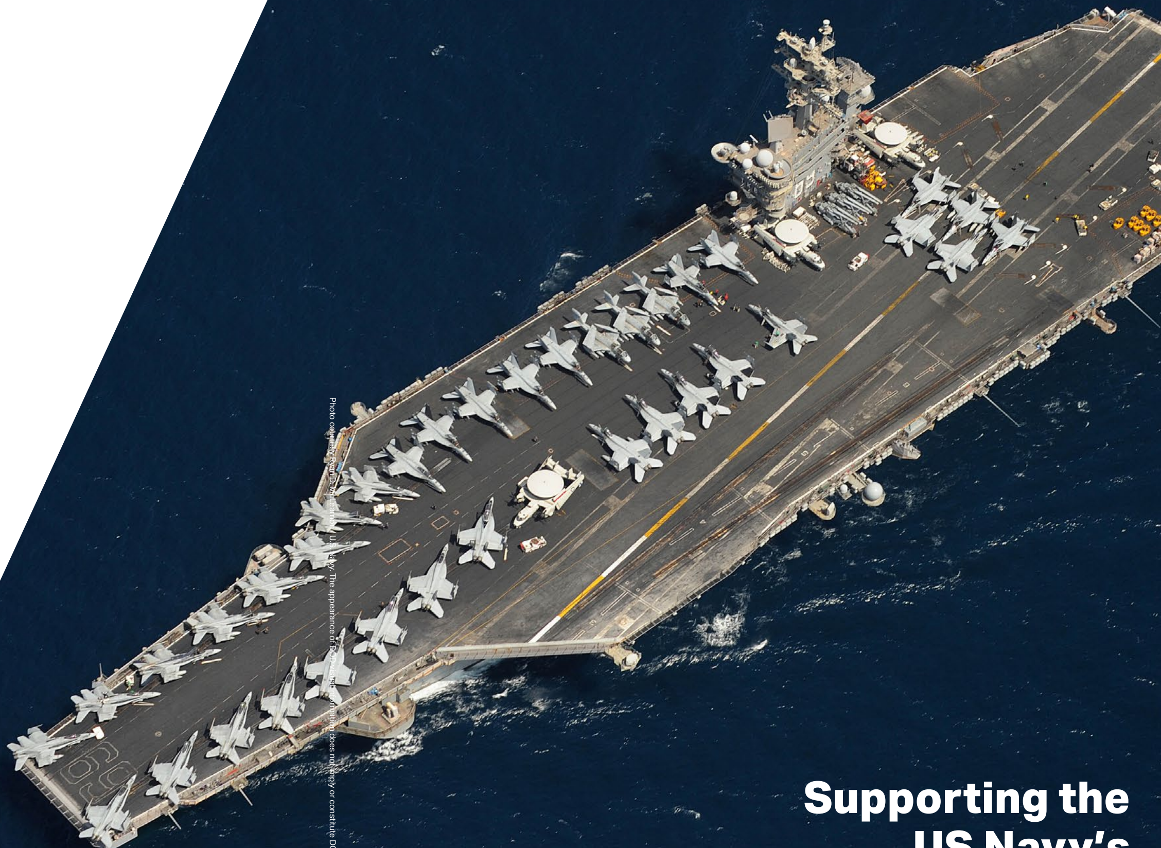
RAND is a non-profit organization. RAND's appearance of RAND is not an endorsement of RAND or its products. RAND's appearance of RAND does not imply or constitute DOD endorsement.

Supporting the US Navy's global missions