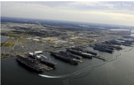
AECOM is providing planning services for the Shipyard Infrastructure Optimization Plan, which aims to maximize efficiency at Navy shipyards in Norfolk, Pearl Harbor, Portsmouth, and Puget Sound.