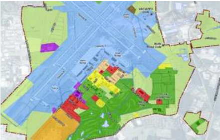
AECOM prepared the NAS Oceana, Virginia Installation Development Plan (IDP) to guide master planning and real property investment at this master jet base for the next 25 years. The IDP integrates strategic installation planning components and real property development details for NAVFAC Mid-Atlantic.