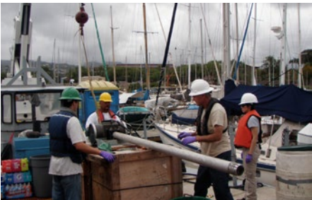
AECOM has served NAVFAC Pacific Comprehensive Long-Term Environmental Action Navy (CLEAN) continuously since 1995. We performed sediment core sampling for the Pearl Harbor sediment remedial investigation in Oahu, Hawaii.

2020 Engineering News-Record (ENR) Rankings