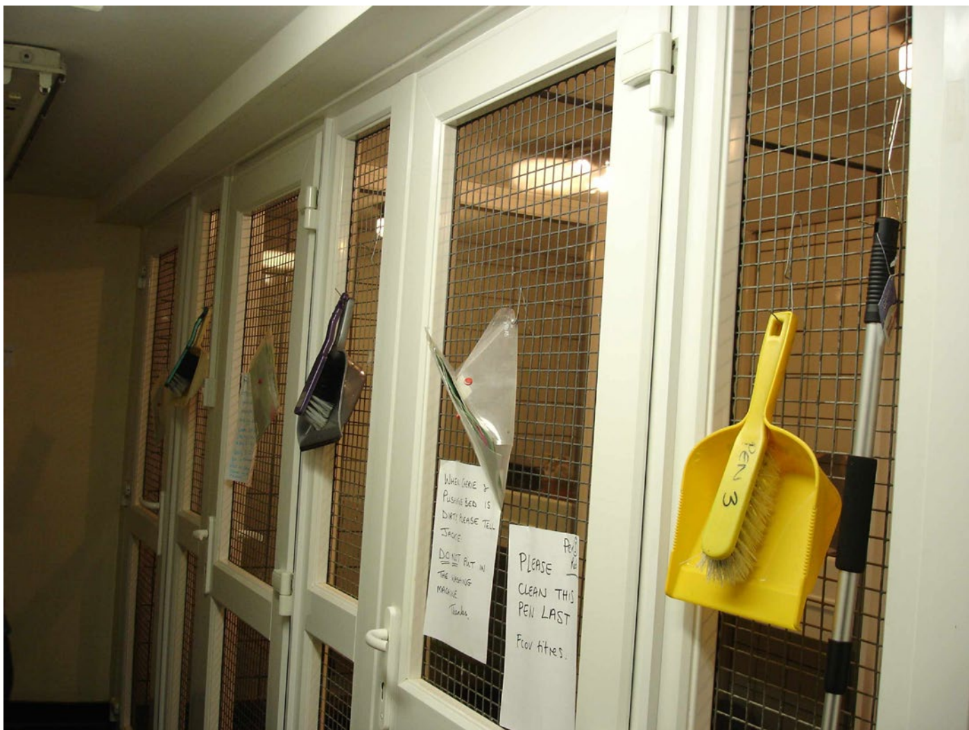
Figure 2. In this FCoV-aware veterinary cat ward, each pen had its own brush and shovel so that no pathogen fomites would be spread from pen to pen on brush bristles. Brushes and shovels were disinfected between pen occupants.

2019). However, different cat litters have been shown to have different abilities to inhibit FCoV in vitro , and Fuller's Earth-based cat litters were able to prevent infection of cell culture, while sawdust-based cat litters had little inhibitory effect on the virus. In two households, there appeared to be less virus shedding on a Fuller's Earth non-clumping cat litter (Dr Elsey Cat Attract) (Addie et al., 2019).