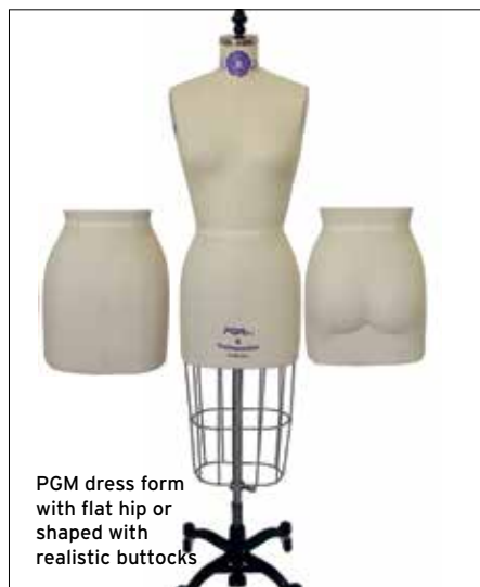
PGM dress form with flat hip or shaped with realistic buttocks