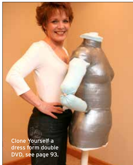
Clone Yourself a dress form double DVD, see page 93.