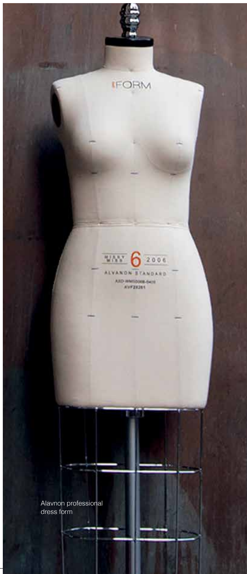
Alavnon professional dress form