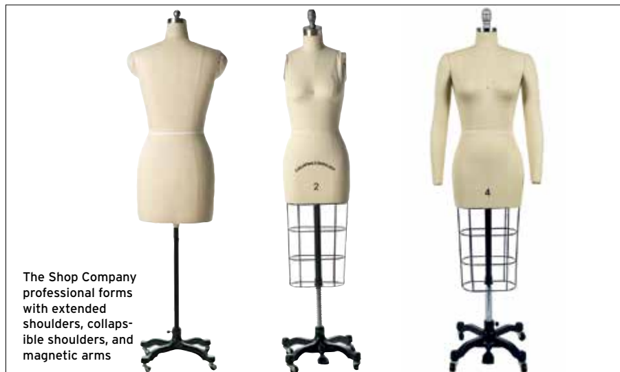
The Shop Company professional forms with extended shoulders, collapsible shoulders, and magnetic arms

Vogue Pattern V1004 fitting shell is a pattern designed to help determine your personal fitting alterations for patterns with waistline seams. It includes seven pages of fit guidelines to help adjust patterns for problems such as a swayback, a flat bottom, broad shoulders, etc. Once the shell fits you perfectly, you can stuff it with foam to hold its shape or use it as a guide for padding out a commercial dress form. ☞