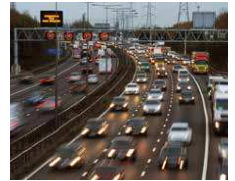
We provided preliminary and final design services for England's Smart Motorways.

We investigated the technical readiness to support the deployment of automated and connected vehicles for the New Zealand Transportation Agency. This research focuses on the necessary infrastructure, technologies and systems to support advanced levels of vehicle automation and connected vehicles. Our analysis was primarily focused on three areas: emerging vehicle technology, intelligent network management and shared mobility.