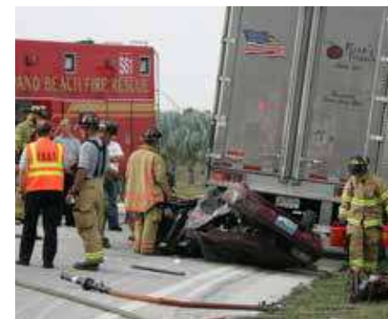
Above: AECOM's full range of TIM services encompasses training and TIM leadership, operations of service patrols and incident response vehicles.