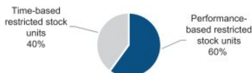
Mix of Long-Term Incentive Awards

In January 2020, Alcoa granted the 2020 LTI awards to the NEOs in order to align their interests with those of stockholders, link compensation to stock price appreciation over a multi-year period, and support retention. Due to stock price volatility as a commodity based company, NEO retention concerns and peer benchmark data, the Committee determined to eliminate stock options from the 2020 equity mix. The 2020 LTI awards were in the form of 60% PRSUs (at target) and 40% time-based RSUs. In each case, the grant value was based upon the job band of each NEO and his contribution to the Company at the time of grant.