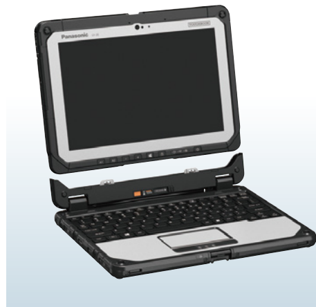
Product: TOUGHBOOK CF-20

culture and ideas in relation to used cars pose certain obstacles. As we have already standardized all evaluation criteria for inspections by the vehicle inspection system, this is expected to become a strong foothold going forward."