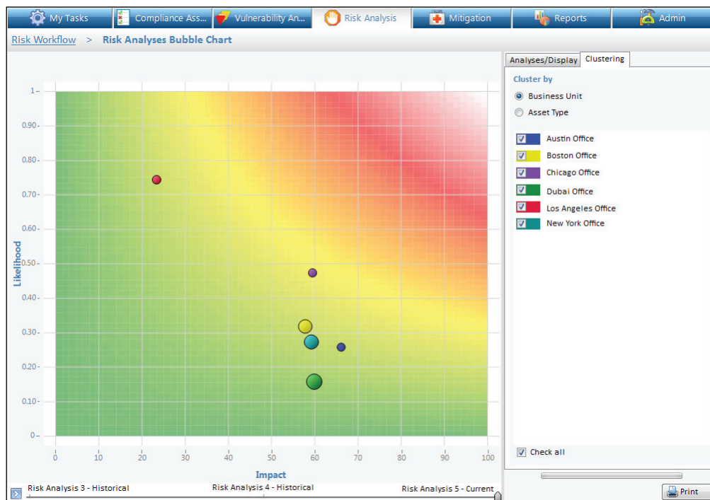
Figure 3: Individual bubbles represent business units. Bubbles in the green area are at low risk to the organization. Those in the yellow or red area represent a greater risk to the organization.