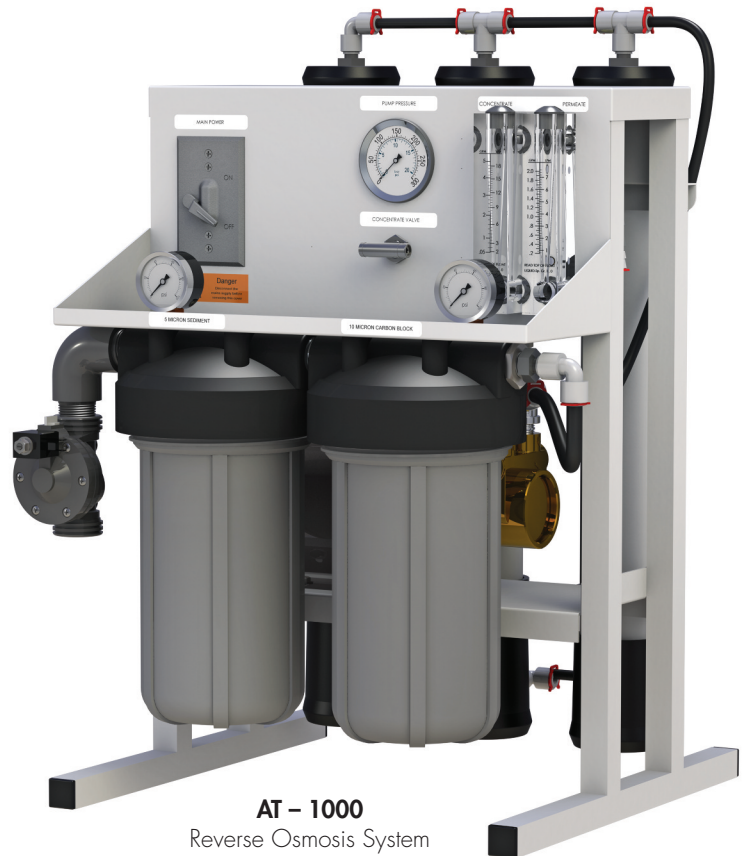
AT – 1000 Reverse Osmosis System

FLEXEON AT – Series Reverse Osmosis Systems can also be upgraded for higher recovery rates by adding the concentrate recycle option.