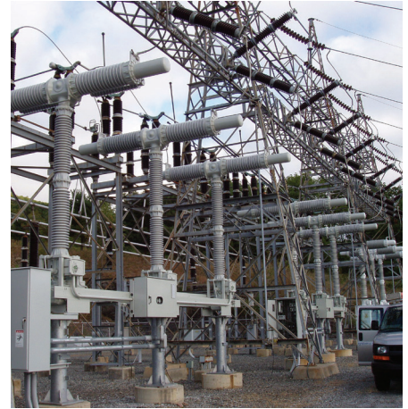
Siemens LPO 245kV live-tank power circuit breaker