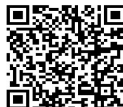
ABB Review featuring power protection technology

www.abb.com/energystorageandgrid-stabilization