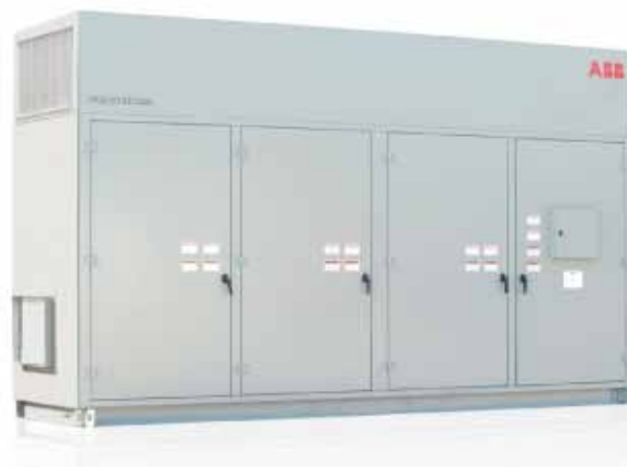
PCS100 STATCOM that is providing voltage regulation to the steel industry

ABB's technology provided a range of benefits, including the modular construction of the PCS100 STATCOM, which makes the platform very reliable. If one of the power modules fails, the system will not trip, but will continue to operate at reduced capacity. This level of reliability is unique in the industry. Also the PCS100 STATCOM has a smaller footprint, a smaller parallel capacitor bank, faster dynamic performance and active filtering