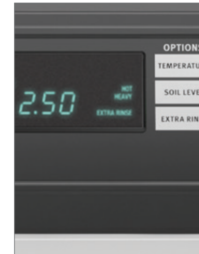
Screen image simulated.

The traditional agitator alternates between four distinct wash patterns and has three deep-water wash cycles to meet individual load needs while providing extraordinary wash performance.