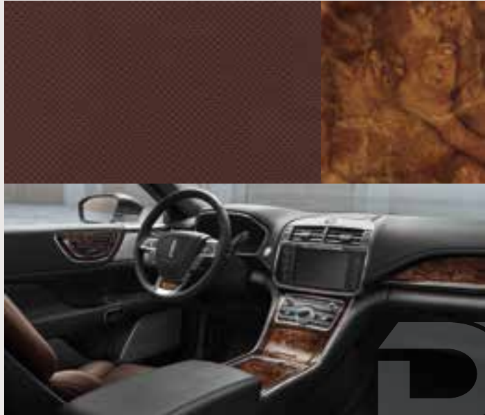
Terracotta Brown Swirl Walnut