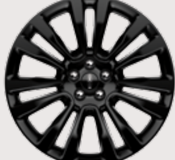
Continental Reserve 20" Premium Ebony-Painted Aluminum Included with Monochromatic Appearance Package