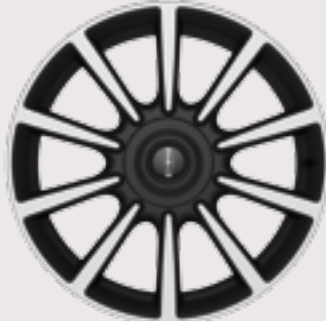
Continental Reserve 19" Polished Aluminum with Premium Dark Tarnish-Painted Pockets Standard