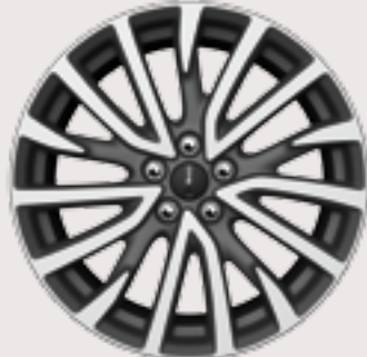
Continental 19" Premium Dark Stainless-Painted Aluminum with Chrome Inserts Included with Premium Package