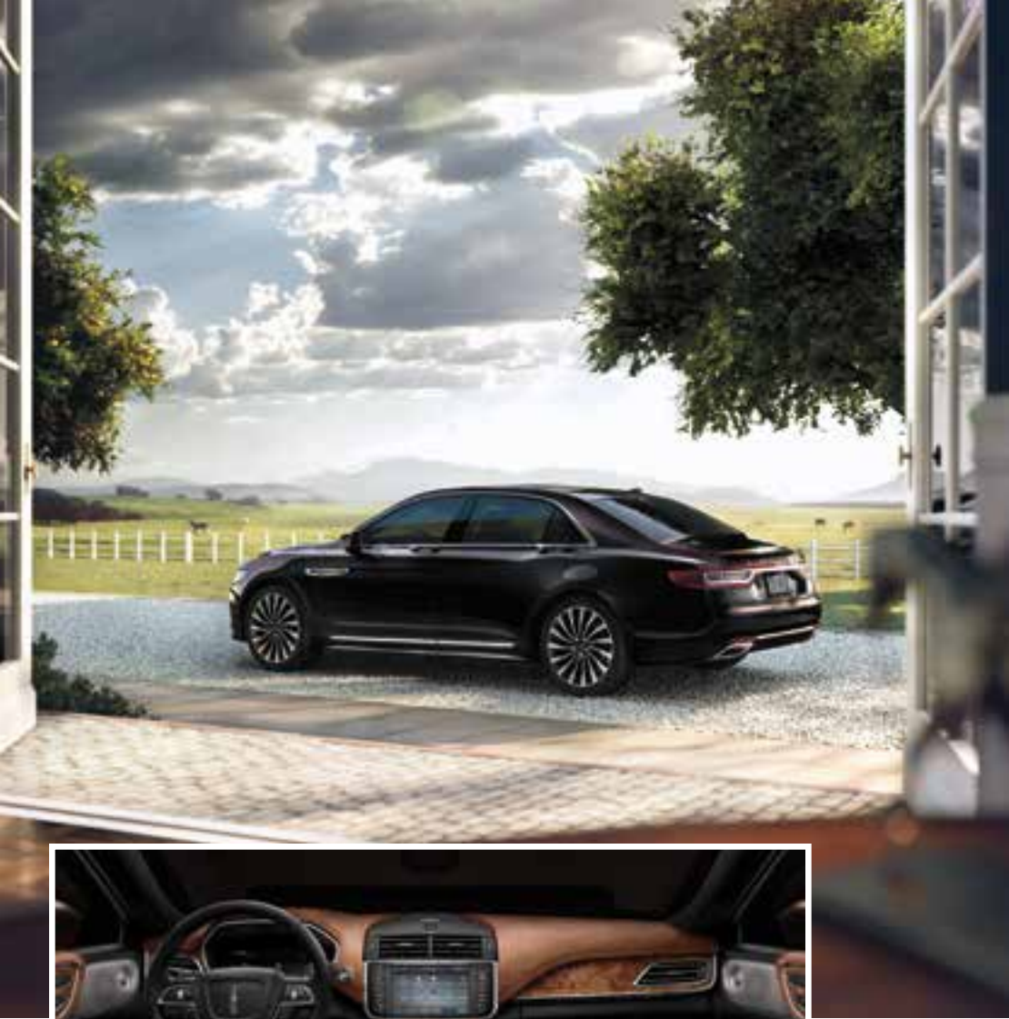
THOROUGHBRED Jet Black Venetian/Chilean Maple