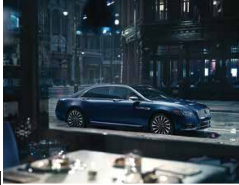
RHAPSODY Rhapsody Blue Venetian & Alcantara/Silver Mesh