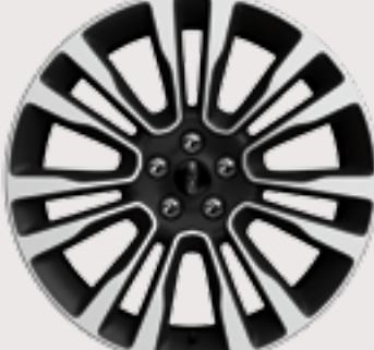
Continental/Continental Reserve 20" Polished Aluminum with Dark Tarnish-Painted Pockets Optional on Continental (requires Premium Package) Included with Luxury Package on Continental Reserve