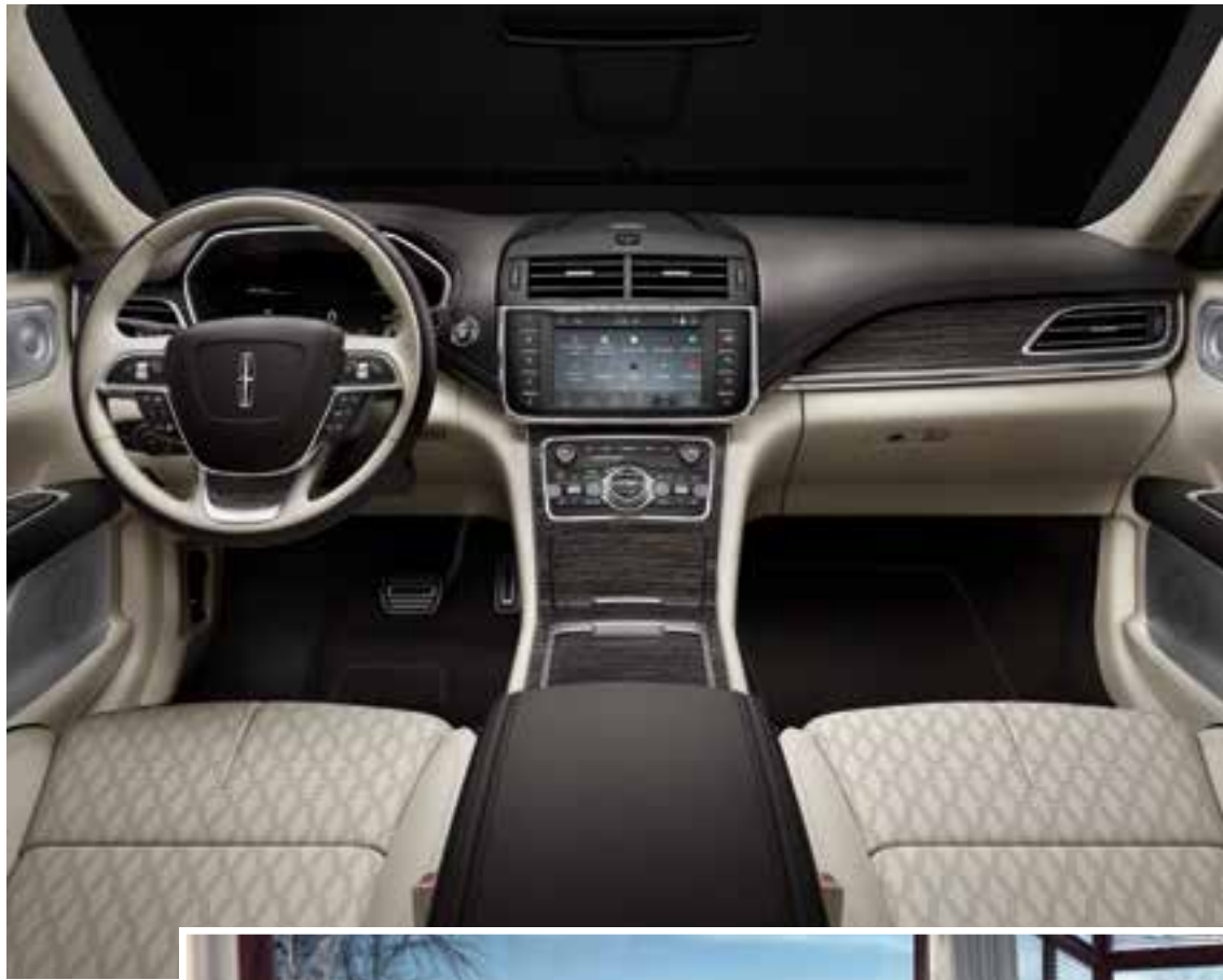
CHALET Alpine Venetian/Silverwood