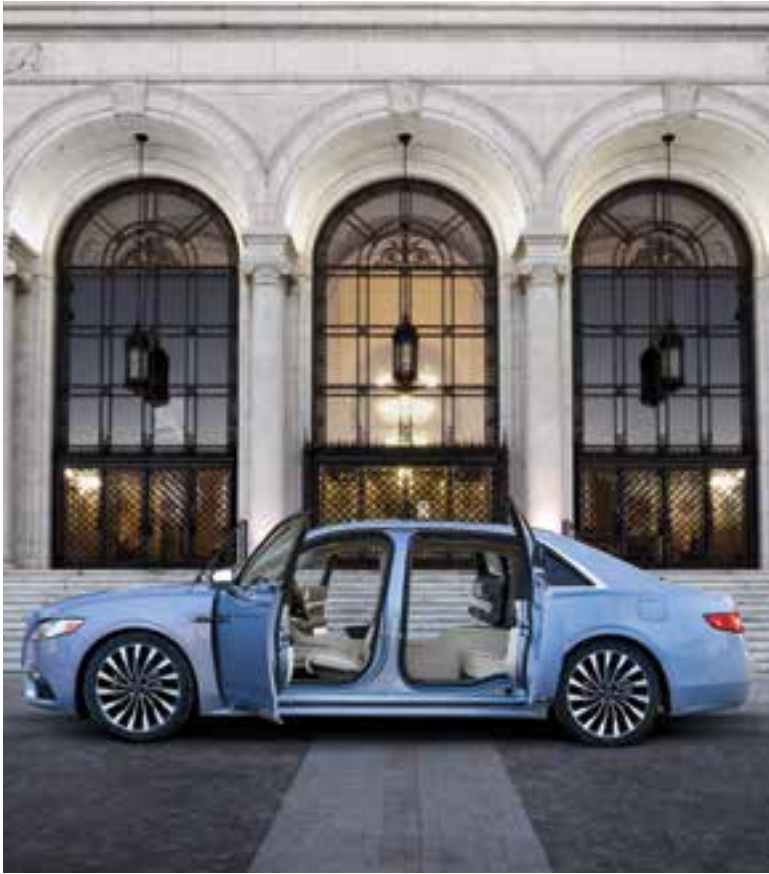
COACH DOOR 1 Chalet (shown) or Thoroughbred