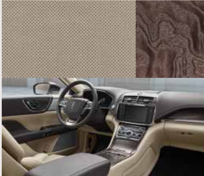
Cappuccino² Espresso Ash Swirl