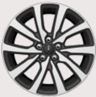
Continental 18" Premium Magnetic-Painted Aluminum Standard

Start taking the fast, smart and friendly way through security with CLEAR