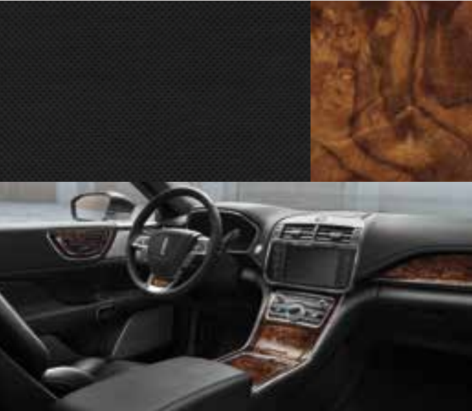
Ebony² Brown Swirl Walnut