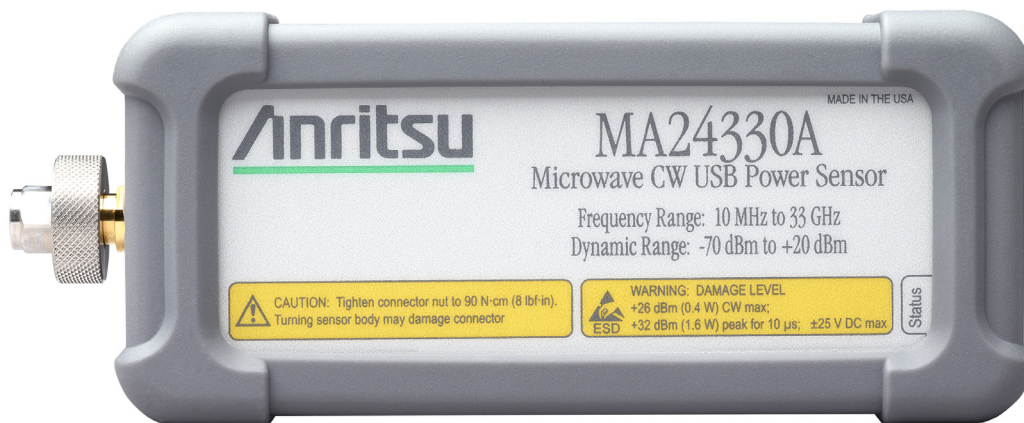
MA243x0A Series Microwave CW USB Power Sensors