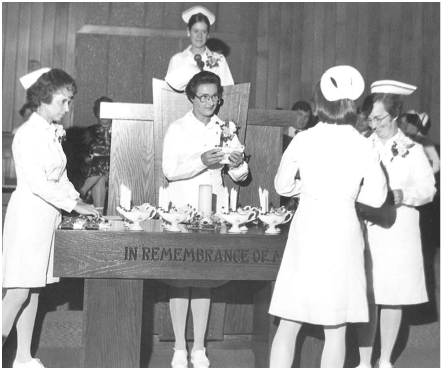
Nursing students participate in a "pinning" ceremony circa 1971 in Conshohocken.