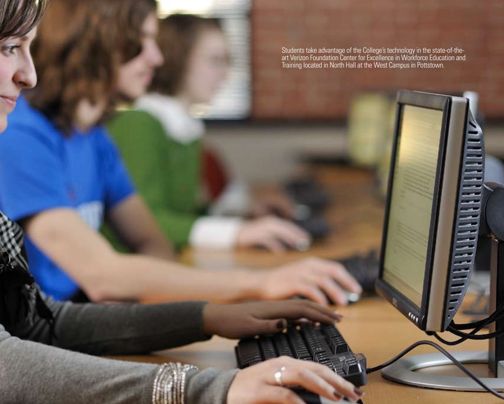
Students take advantage of the College's technology in the state-of-the-art Verizon Foundation Center for Excellence in Workforce Education and Training located in North Hall at the West Campus in Pottstown.

interactive classroom technologies, such as clickers and game show technology, to ensure that students interact with each other and with the subject matter to improve learning.