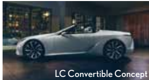
LC Convertible Concept

Kelley Blue Book awards Lexus the Best Overall Luxury Brand and Most Trusted Luxury Brand in 2019 Brand Image Awards