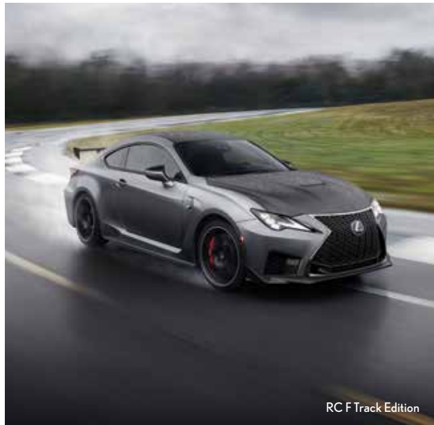
RC F Track Edition