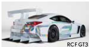
RC F GT3

RC F GT3 racing concept makes first U.S. appearance in Las Vegas at SEMA