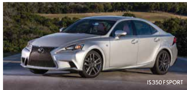
IS350 F SPORT