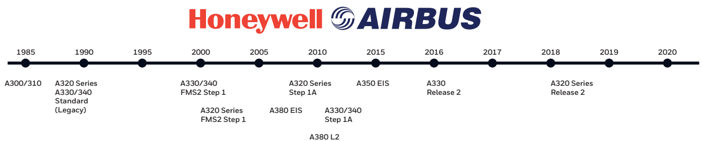
Figure 4: Honeywell Airbus FMS Evolution Timeline

The Honeywell Airbus FMS software has undergone significant evolutions since the first version was certified on the A300/310 in 1986. In the 30 years of joint development of best-in-class FMS on all Airbus airline transport aircraft, many innovations have been incorporated in the baseline that has evolved into the current Pegasus FMS for the A320 series and A330, and the new derivatives that have become the standard (sole source) FMS on the Airbus A380 and A350. The driving force behind the feature and functionality insertions result from both changes within the airspace and innovations that result from Honeywell’s unparalleled breadth of airline transport FMS offerings and industry leadership. Figure 4 below provides a timeline showing the Honeywell Airbus FMS evolutions on the A300/310, A320 Series, A330/340, A380 and A350 covering the entire Airbus fleet, legacy and active model base.