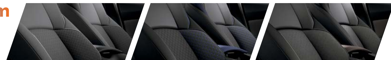
LE fabric shown in Black with Gunmetal accent