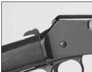
The hammer shown in the full-cock position.