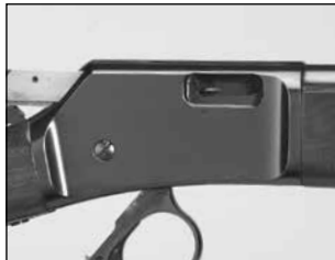
Open the action slightly for cleaning.