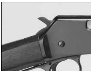
The hammer shown in the dropped or fired position.