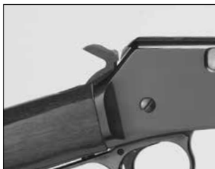
The hammer shown in the half-cock position.