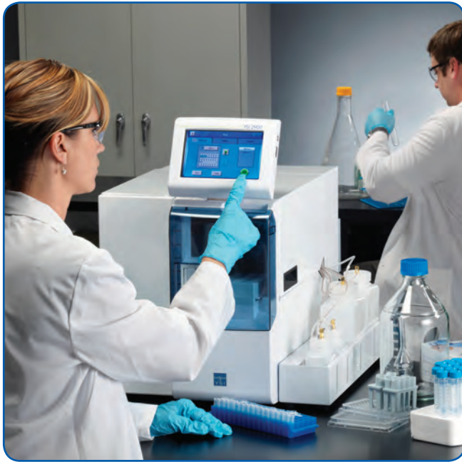
Figure 2 The YSI 2950 Biochemistry Analyzer can simultaneously measure up to six chemistries for raw materials, R&D, in-process and final product sample analysis.

Sample analysis requires little or no preparation due to the YSI Biochemistry Analyzer's unique sample chamber design and membrane characteristics, which makes the enzyme electrode impervious to sample color, pH, turbidity, cell concentrations, salts, proteins, detergents and other low molecular weight interferences. Additionally, only small sample volumes are needed, ranging between 10-50 \mu\text{l} . The YSI 2900 Series Biochemistry Analyzers are highly flexible, modular platforms with a range of configurations, options and accessories to meet the various needs of the food process cycle, regardless of scale of operations (Figure 2).