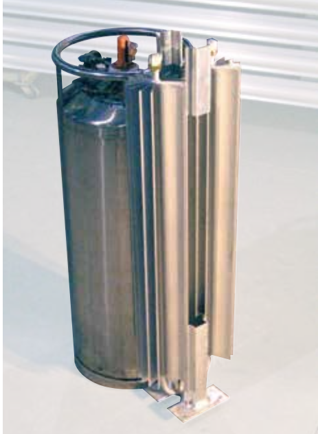
Model D8A-3M connected to liquid cylinder.

Chart's Dura-cyl and Cryo-cyl liquid cylinders come equipped with an internal vaporizer to provide gas for various applications. But when increased flow rate is needed, use the D8A-3M to economically boost gas withdrawal rates.