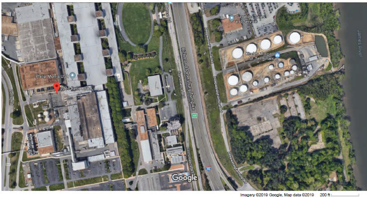
Figure 1. Location of the Manufacturing Facility

The manufacturing facility is surrounded by a residential development across a road to the north; a two-lane divided road and an interstate freeway (I-95) to the east; two hotels, a fast food restaurant, and a