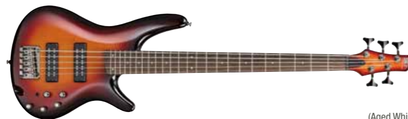
AWB (Aged Whiskey Burst)