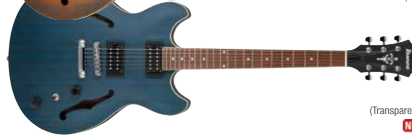
TBF (Transparent Blue Flat) NEW FINISH