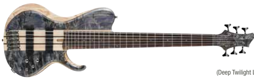
DTL (Deep Twilight Low Gloss)