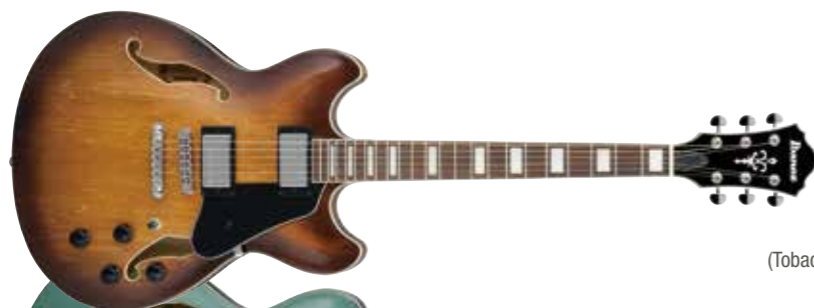
TBC (Tobacco Brown)