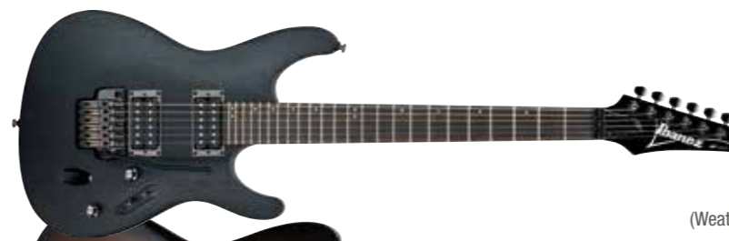
WK (Weathered Black)