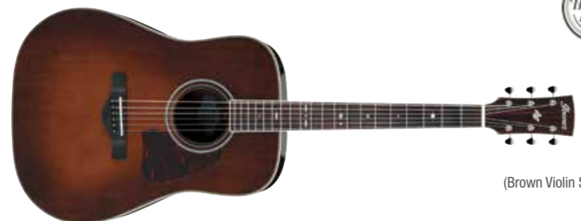
BVS (Brown Violin Sunburst)