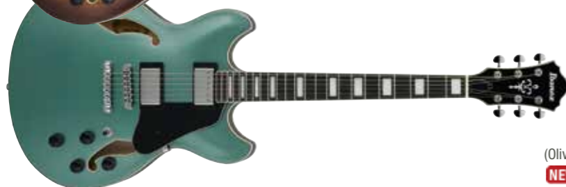
OLM (Olive Metallic) NEW FINISH