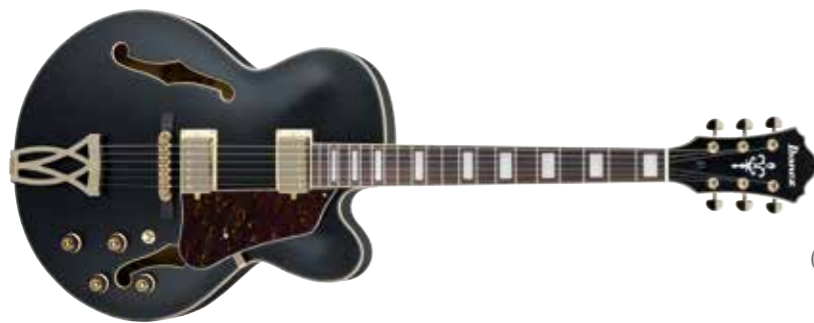
BKF (Black Flat)