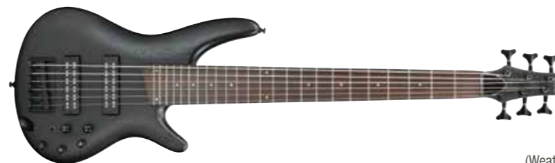
WK (Weathered Black)