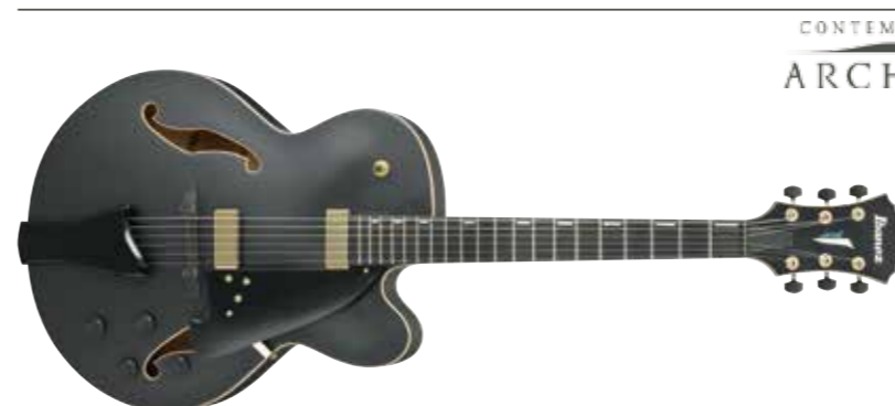
BKF (Black Flat)