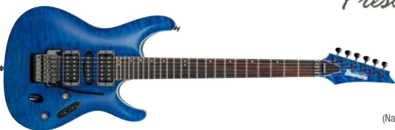
NBL (Natural Blue)