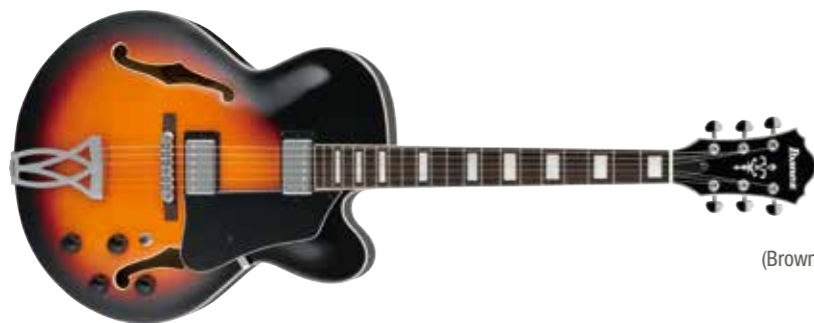
BS (Brown Sunburst)