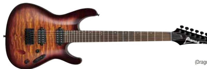
DEB (Dragon Eye Burst)