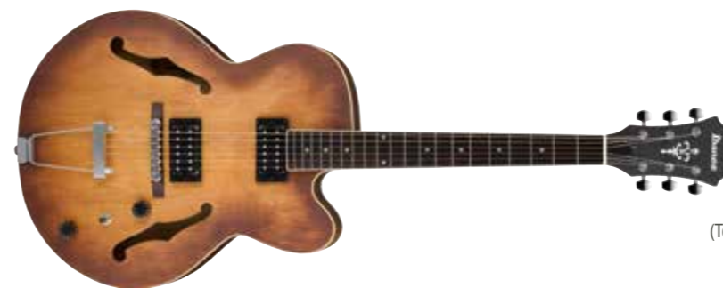
TF (Tobacco Flat)