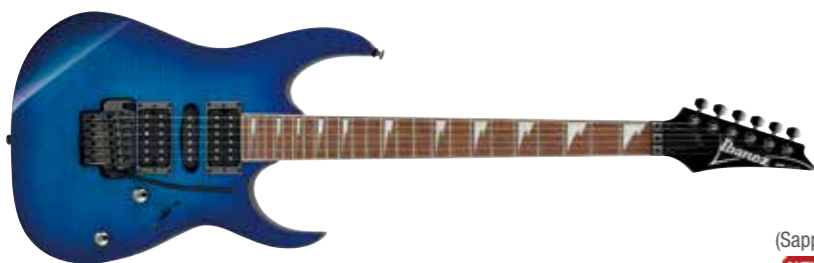
SPB (Sapphire Blue)