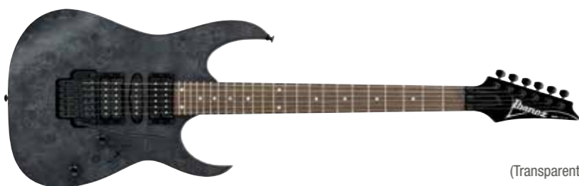
TGF (Transparent Gray Flat)