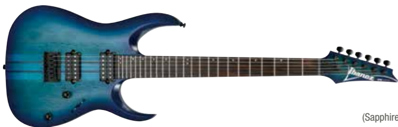
SBF (Sapphire Blue Flat)