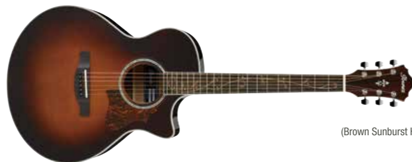
BS (Brown Sunburst High Gloss)