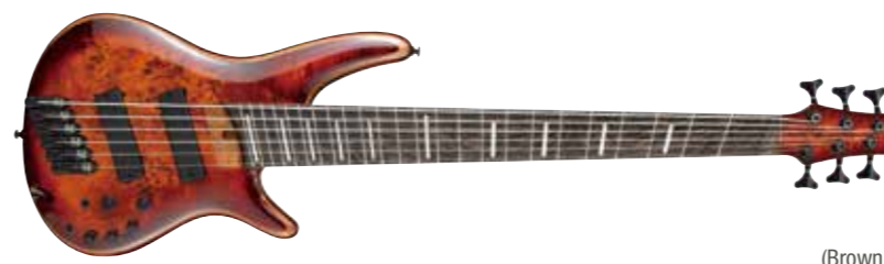
BTT (Brown Topaz Burst)