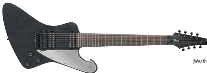
WK (Weathered Black)