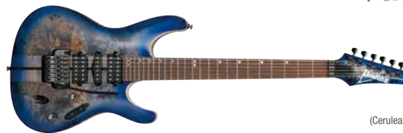
CLB (Cerulean Blue Burst)