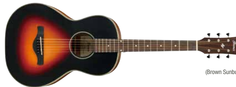
BSM (Brown Sunburst Matte)