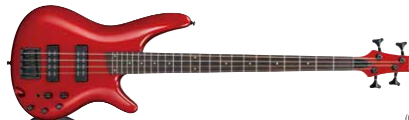
CA (Candy Apple)