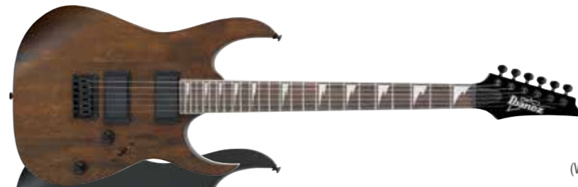
WNF (Walnut Flat)