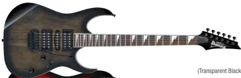
TKS (Transparent Black Sunburst)