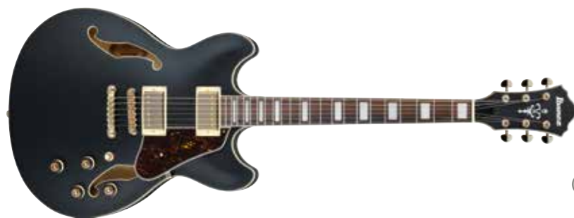
BKF (Black Flat)