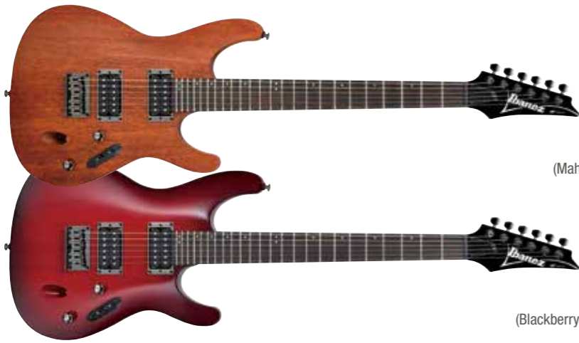
MOL (Mahogany Oil)