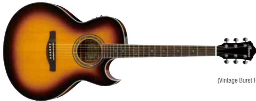
VB (Vintage Burst High Gloss)