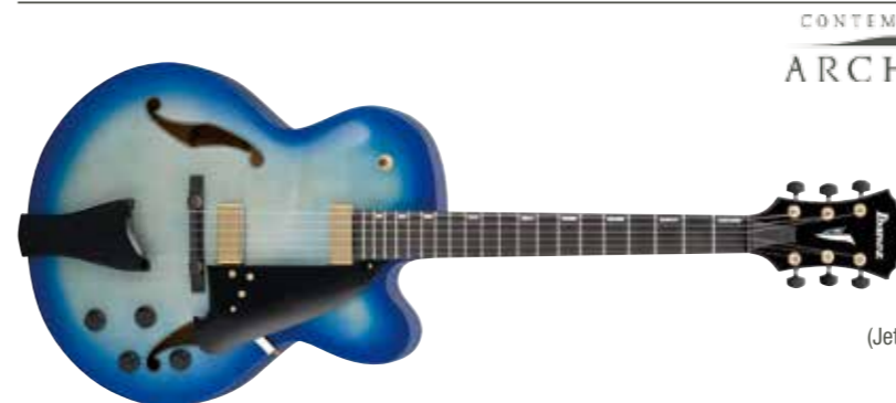
JBB (Jet Blue Burst)