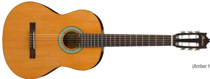
AM (Amber High Gloss)