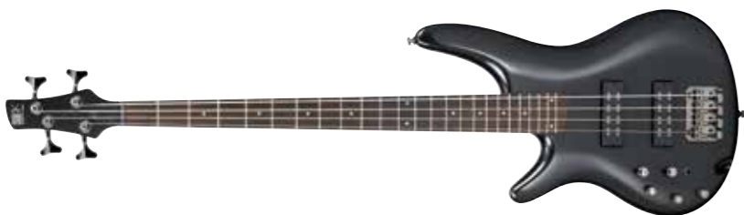
IPT (Iron Pewter)