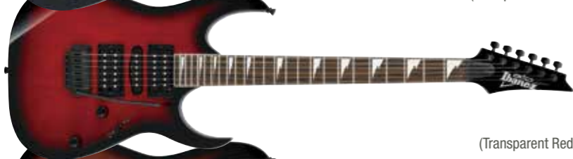
TRS (Transparent Red Sunburst)