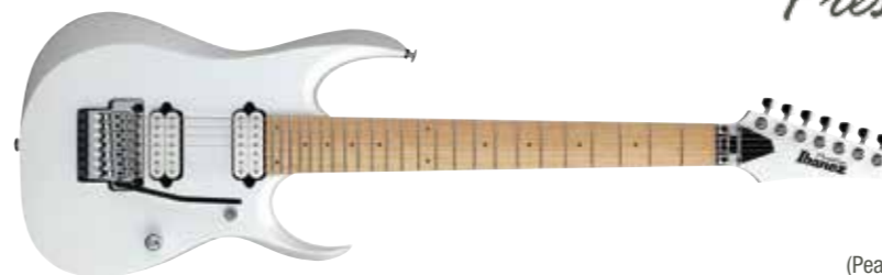
PWF (Pearl White Flat)