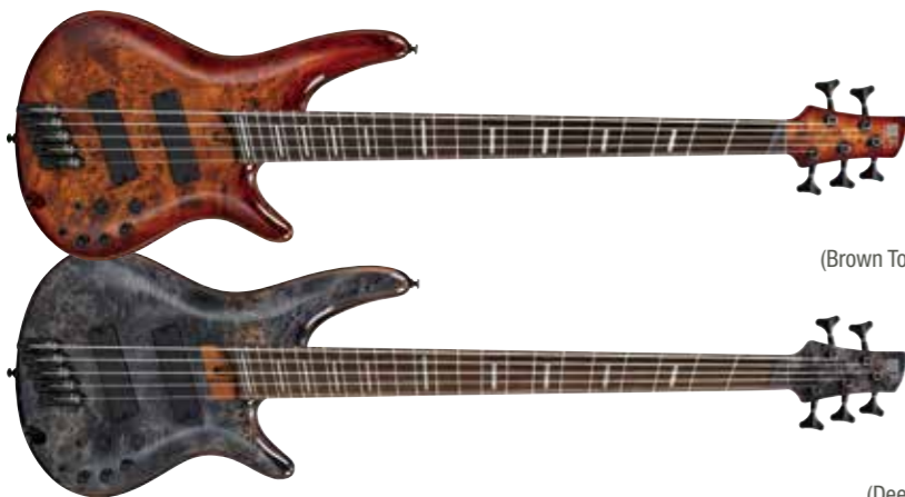
BTT (Brown Topaz Burst)