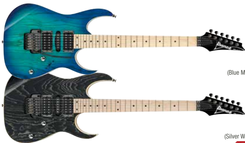
BMT (Blue Moon Burst)