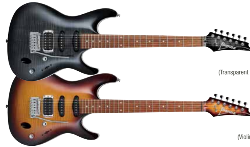
TGB (Transparent Gray Burst)