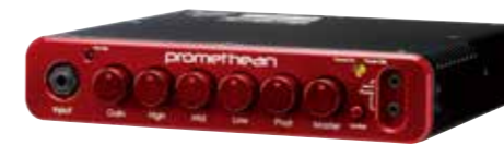
Bass Amplifier Head P300H