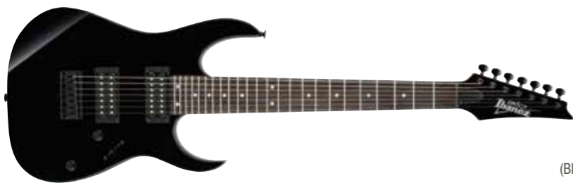
BKN (Black Night)