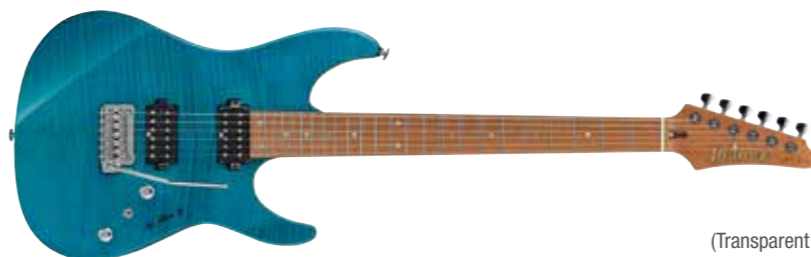
TAB (Transparent Aqua Blue)