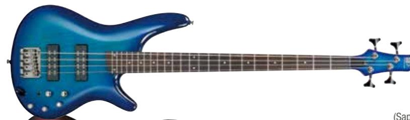
SPB (Sapphire Blue)