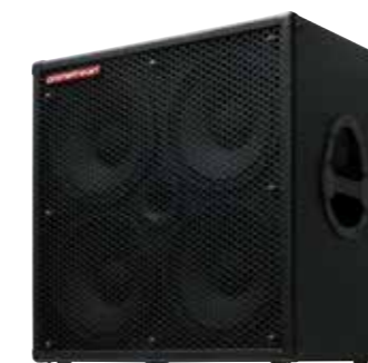
Speaker Cabinet P410CC