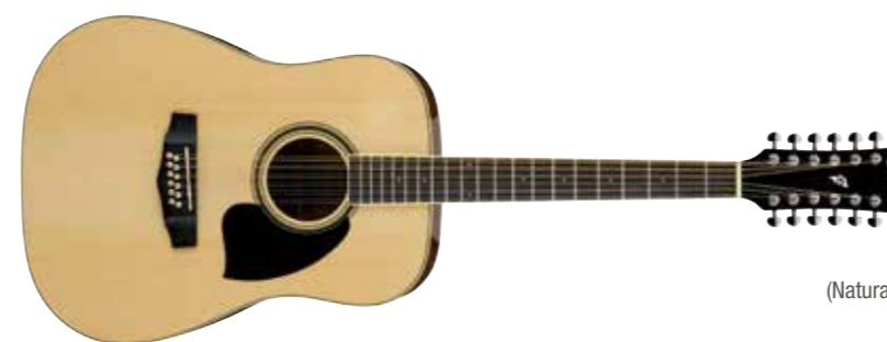
NT (Natural High Gloss)