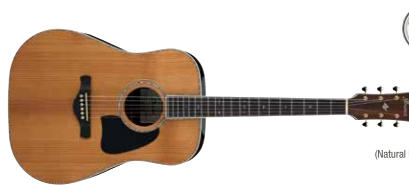
NT (Natural High Gloss)