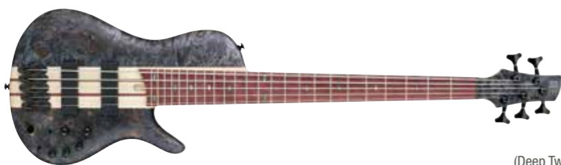
DTF (Deep Twilight Flat)