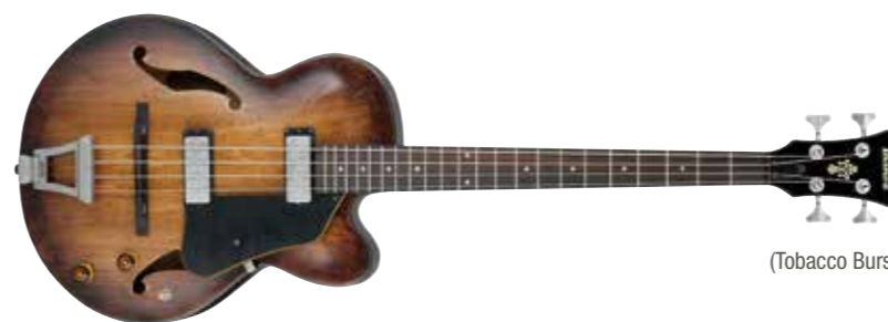
TCL (Tobacco Burst Low Gloss)