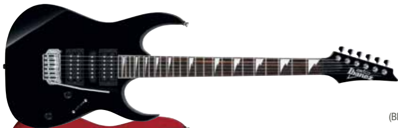
BKN (Black Night)