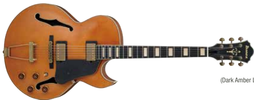
DAL (Dark Amber Low Gloss)