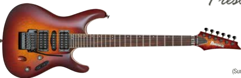
STB (Sunset Burst)