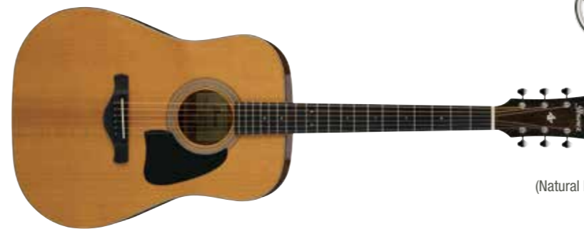
NT (Natural High Gloss)