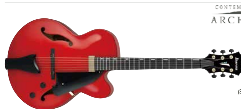
SRR (Sunrise Red)