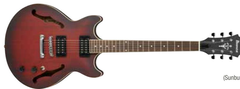
SRF (Sunburst Red Flat)