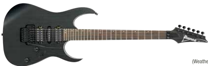
WK (Weathered Black)