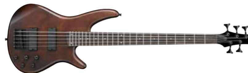
WNF (Walnut Flat)