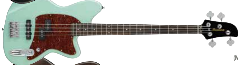
MGR (Mint Green)