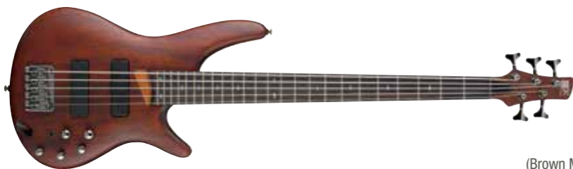
BM (Brown Mahogany)