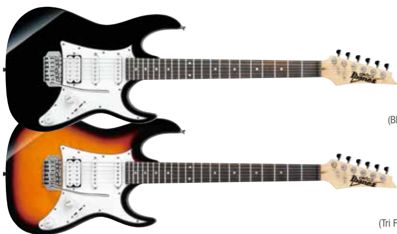
BKN (Black Night)