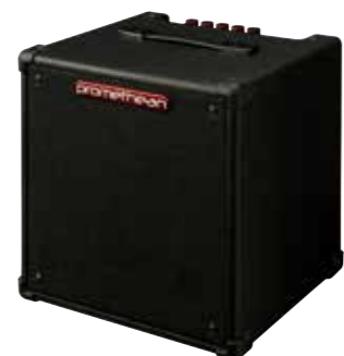
Bass Combo Amplifier P20