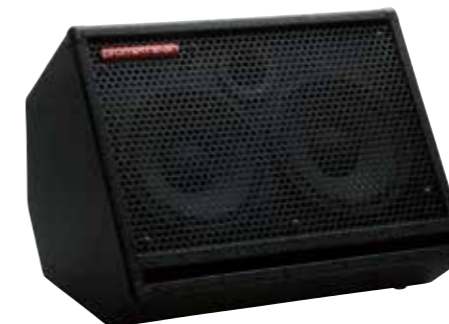
Speaker Cabinet P210KC