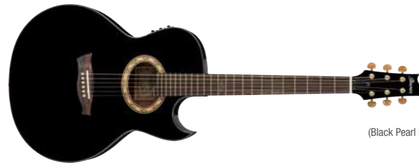
BP (Black Pearl High Gloss)