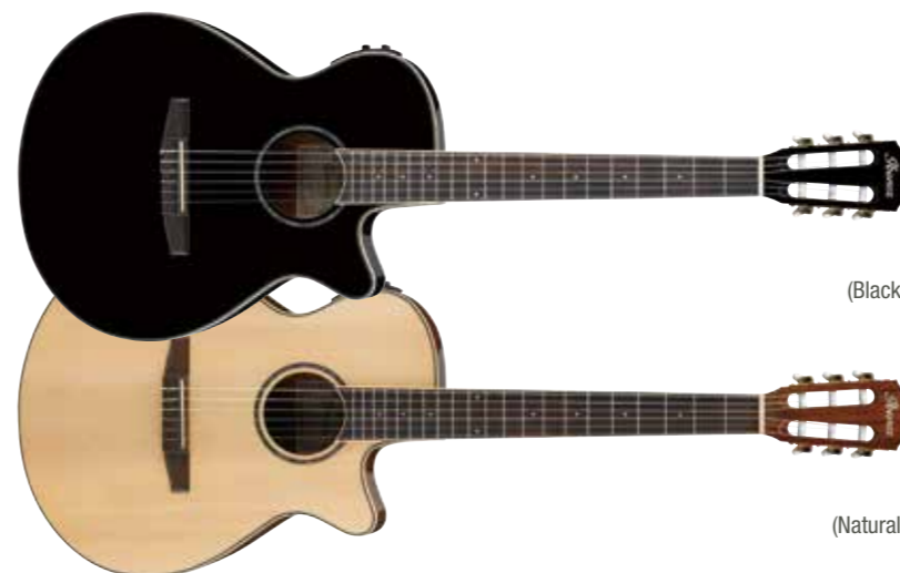
BK (Black High Gloss)