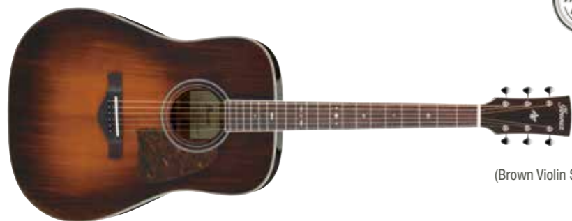
BVS (Brown Violin Sunburst)