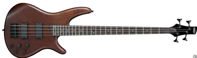
WNF (Walnut Flat)