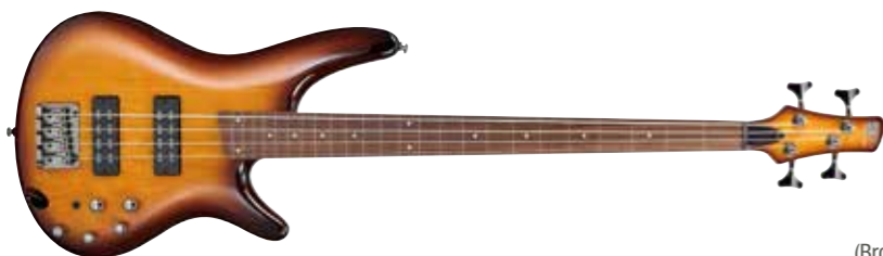
BBT (Brown Burst)