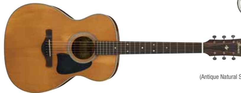
ANS (Antique Natural Semi-Gloss)