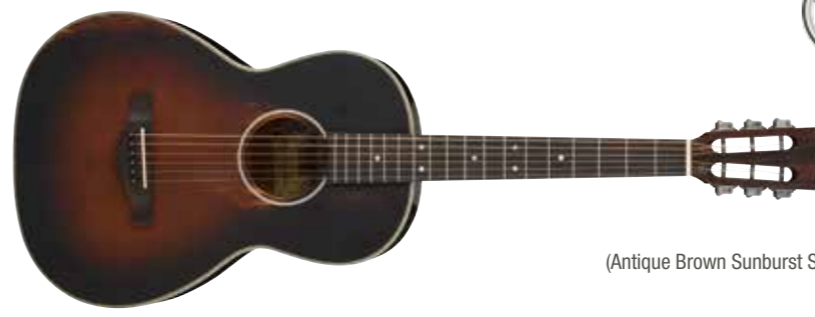
ABS (Antique Brown Sunburst Semi-Gloss)