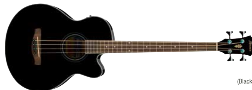
BK (Black High Gloss)