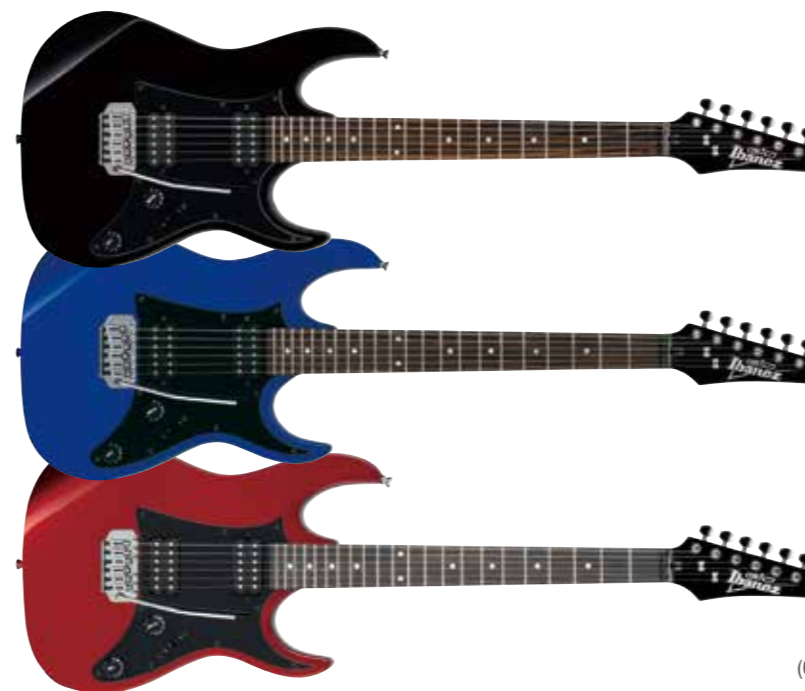
BKN (Black Night)