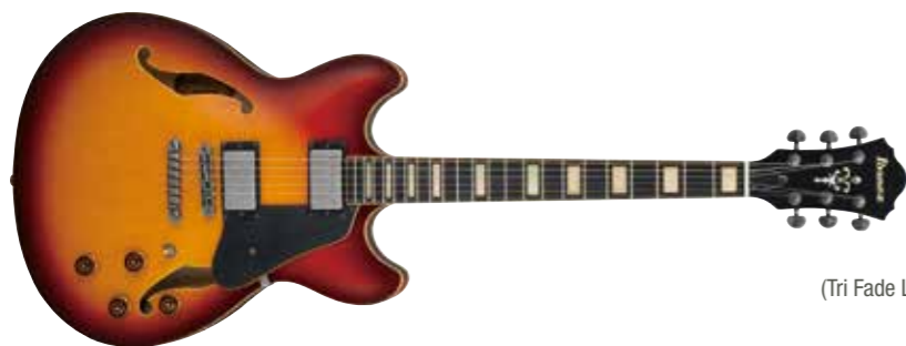
TDL (Tri Fade Low Gloss)