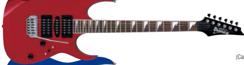
CA (Candy Apple)