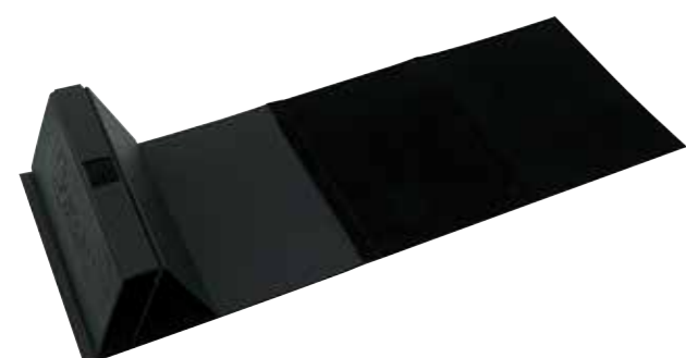
POWERPAD® Guitar Work Station