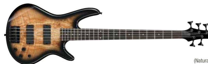
NGT (Natural Gray Burst)