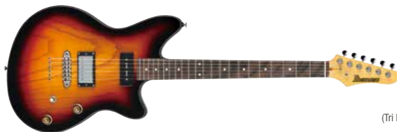
TFB (Tri Fade Burst)