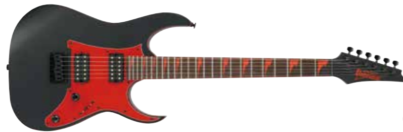
BKF (Black Flat)