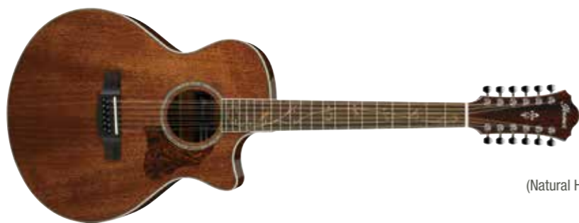
NT (Natural High Gloss)