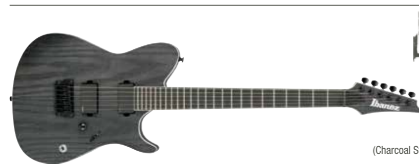
CSF (Charcoal Stained Flat)