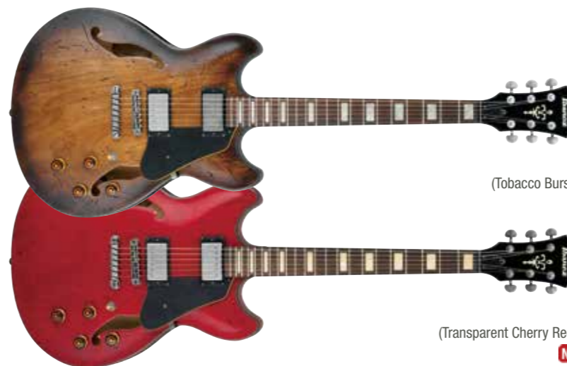
TCL (Tobacco Burst Low Gloss)