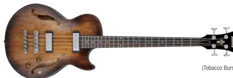
TCL (Tobacco Burst Low Gloss)