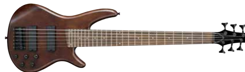
WNF (Walnut Flat)