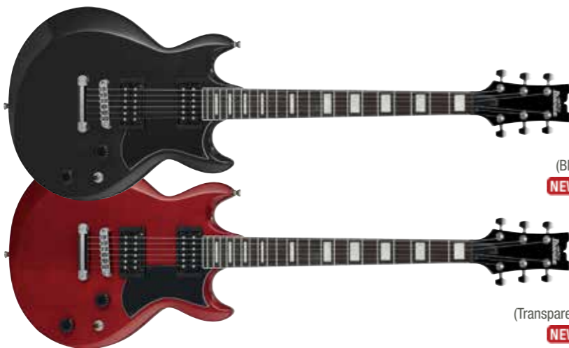
BKN (Black Night) NEW FINISH