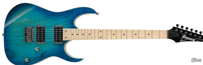
BMT (Blue Moon Burst)