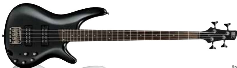
IPT (Iron Pewter)