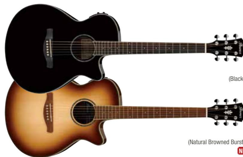
BK (Black High Gloss)