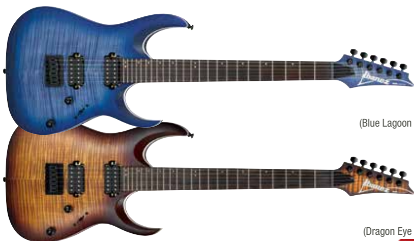
BLF (Blue Lagoon Burst Flat)