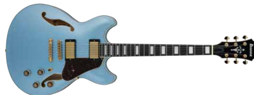
STE (Steel Blue)