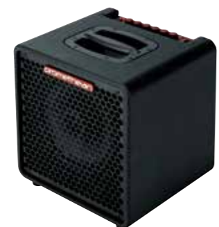
Bass Combo Amplifier P3110