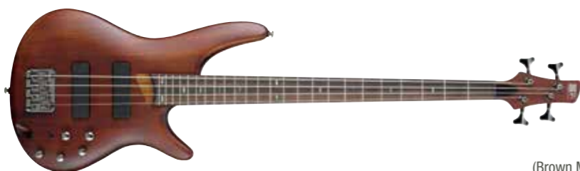
BM (Brown Mahogany)