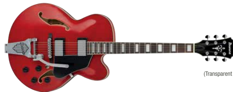
TCD (Transparent Cherry Red)