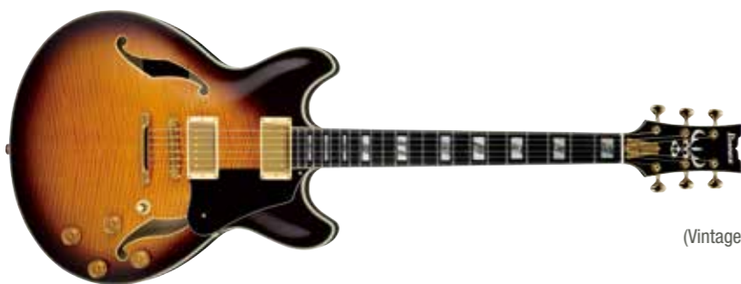
VT (Vintage Sunburst)