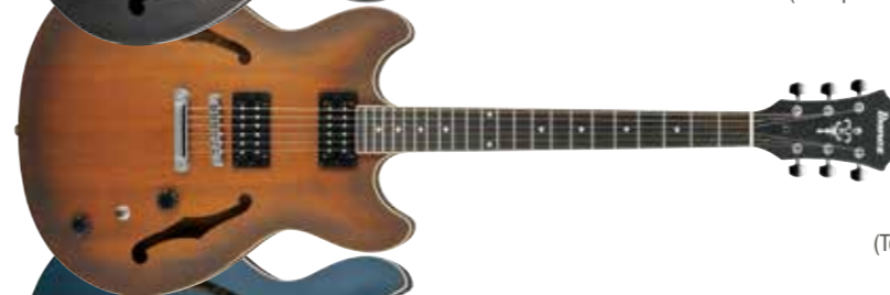
TF (Tobacco Flat)