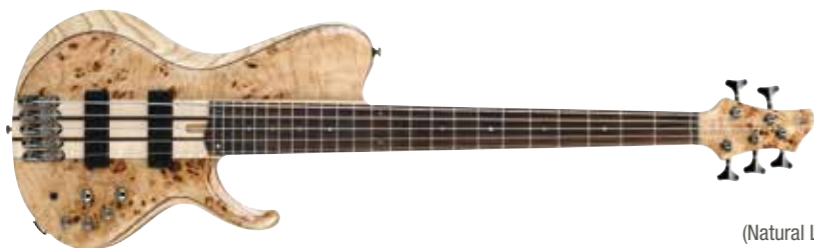
NTL (Natural Low Gloss)