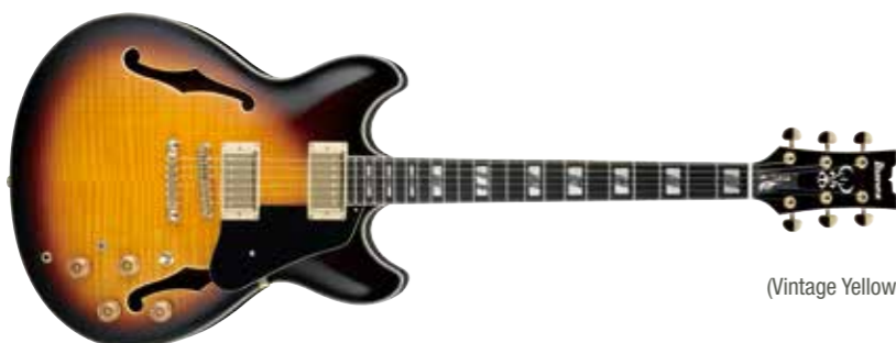
VYS (Vintage Yellow Sunburst)