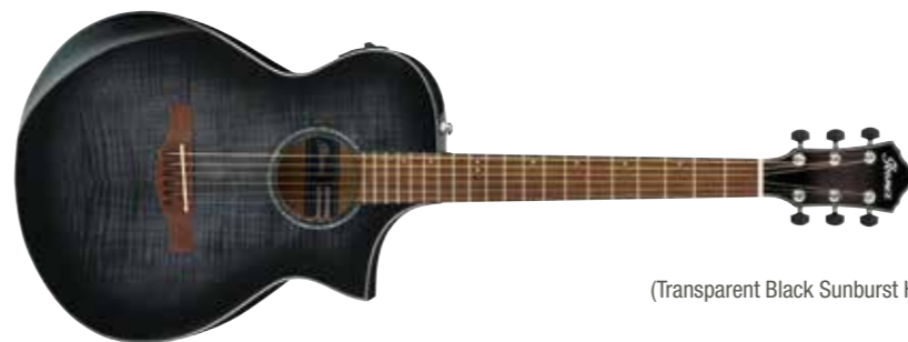
TKS (Transparent Black Sunburst High Gloss)