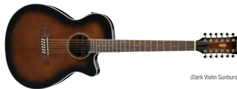
DVS (Dark Violin Sunburst High Gloss)