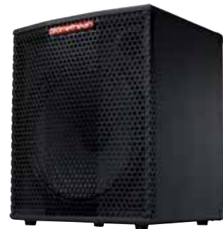
Bass Combo Amplifier P3115