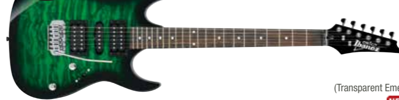
TEB (Transparent Emerald Burst) NEW FINISH