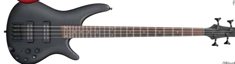
WK (Weathered Black)