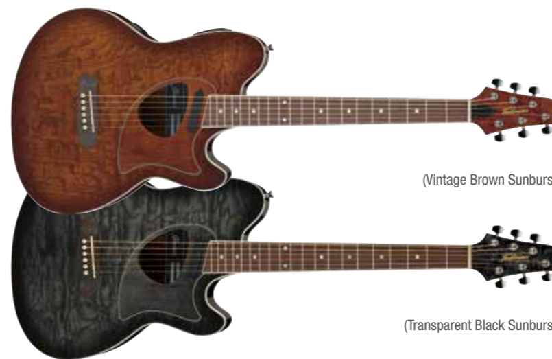
VBS (Vintage Brown Sunburst High Gloss)