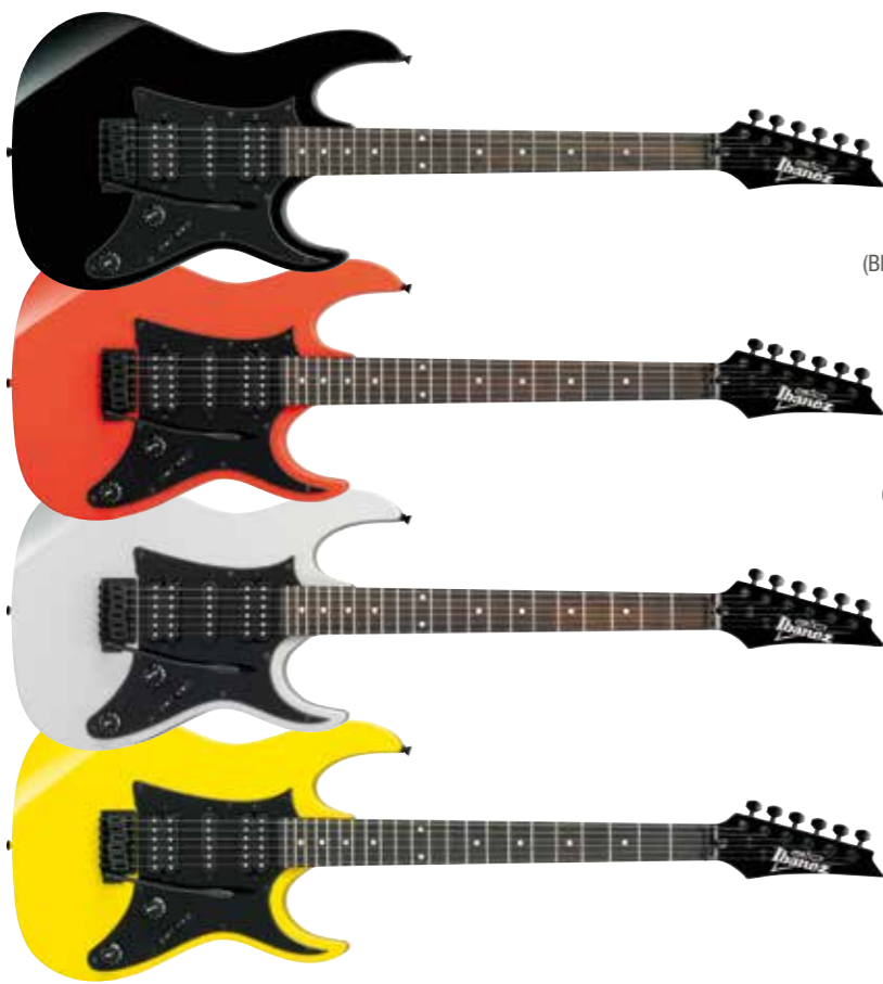
BKN (Black Night)