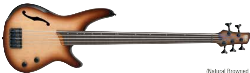
NNF (Natural Browned Burst Flat)