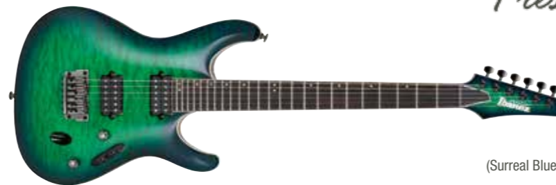
SLG (Surreal Blue Burst Gloss)