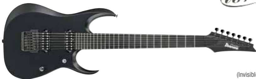
ISH (Invisible Shadow)