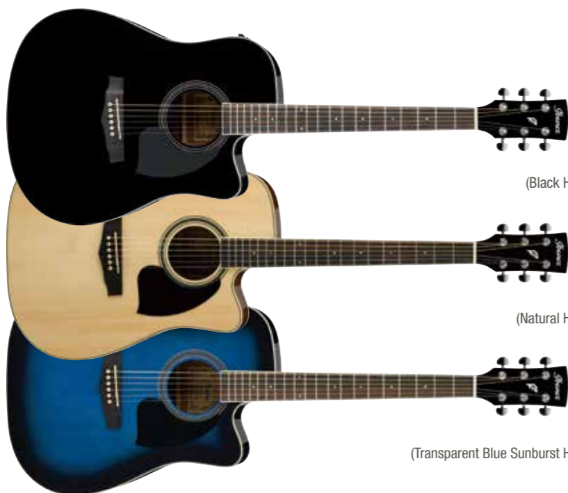
BK (Black High Gloss)