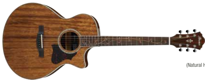
NT (Natural High Gloss)