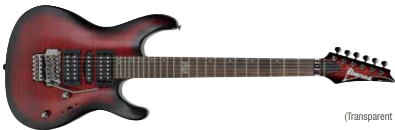
TRB (Transparent Red Burst)