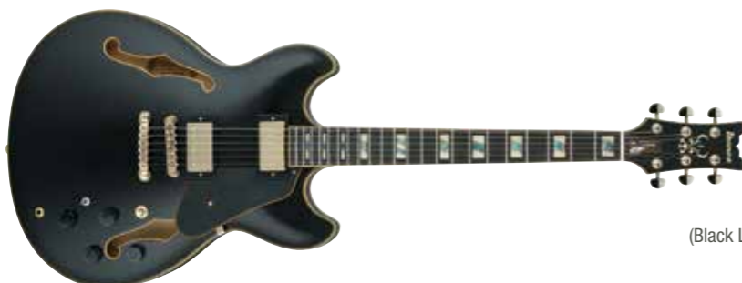
BKL (Black Low Gloss)