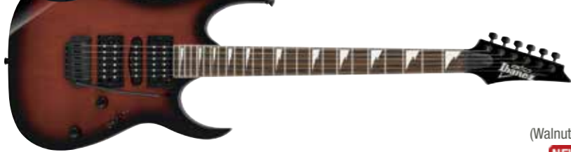
WNS (Walnut Sunburst) NEW FINISH