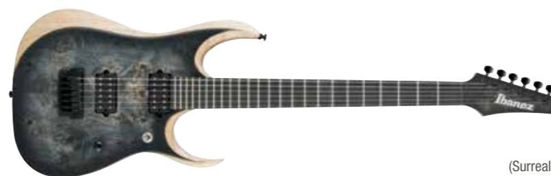
SKB (Surreal Black Burst)