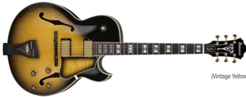
VYS (Vintage Yellow Sunburst)