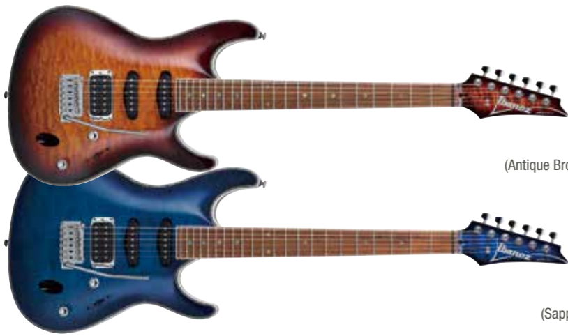
ABB (Antique Brown Burst)