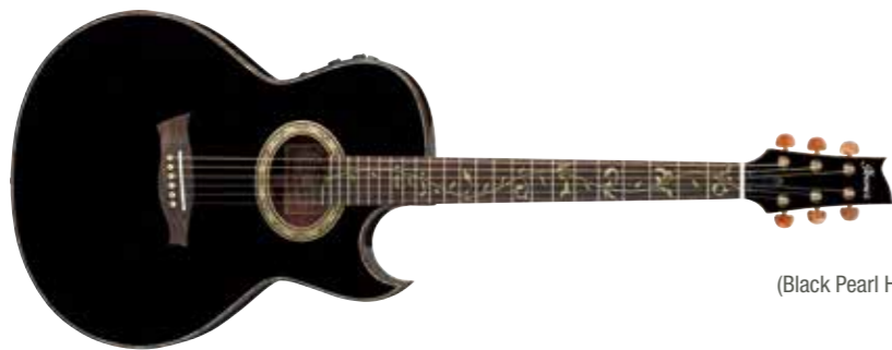
BP (Black Pearl High Gloss)