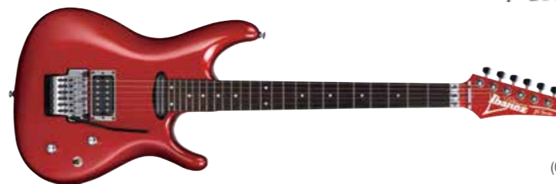
CA (Candy Apple)