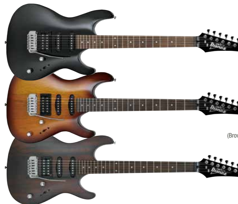
BKN (Black Night)