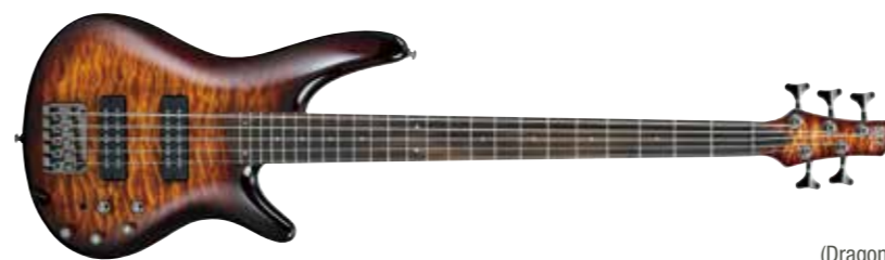
DEB (Dragon Eye Burst)