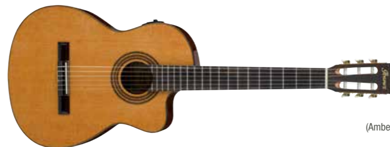
AM (Amber High Gloss)