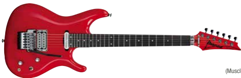
MCR (Muscle Car Red)