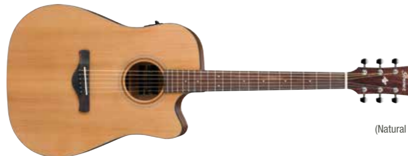
LG (Natural Low Gloss)