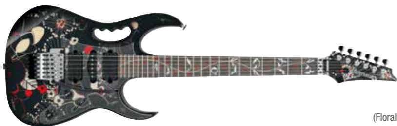
FP2 (Floral Pattern 2)