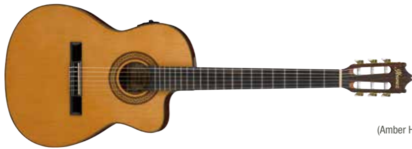
AM (Amber High Gloss)