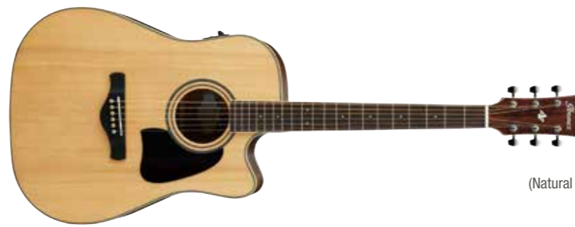
LG (Natural Low Gloss)