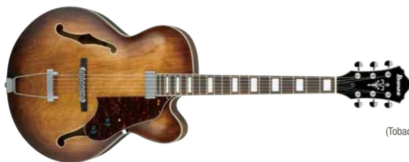
TBC (Tobacco Brown)