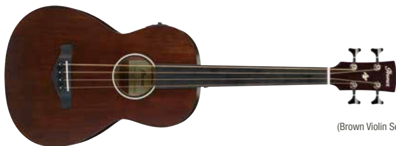
BV (Brown Violin Semi-Gloss)