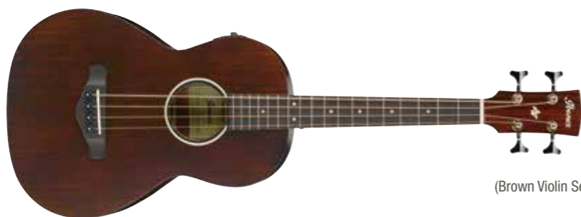
BV (Brown Violin Semi-Gloss)