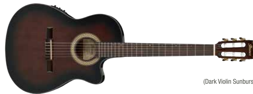
DVS (Dark Violin Sunburst High Gloss)