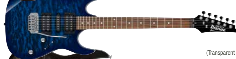
TBB (Transparent Blue Burst)