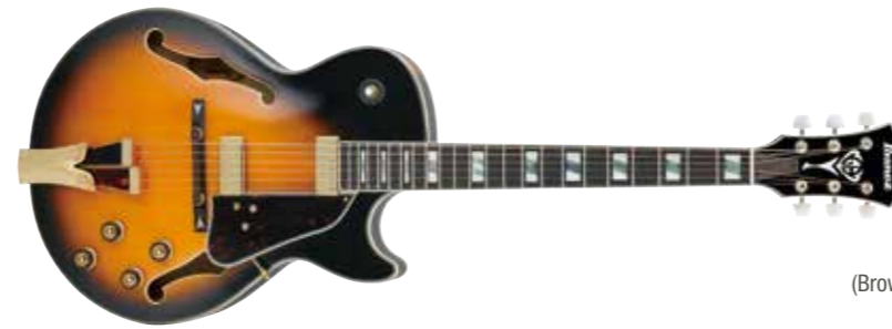
BS (Brown Sunburst)