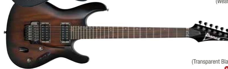
TKS (Transparent Black Sunburst)