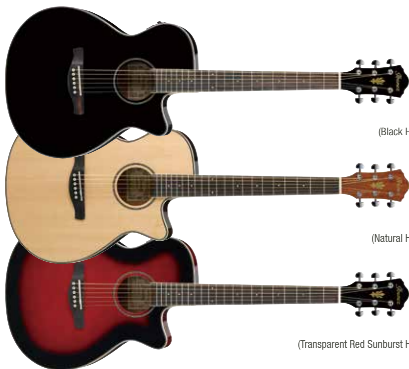
BK (Black High Gloss)