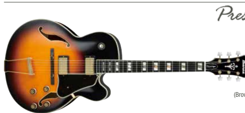
BS (Brown Sunburst)