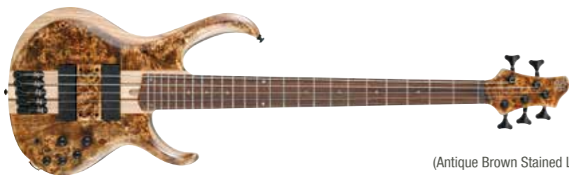
ABL (Antique Brown Stained Low Gloss)