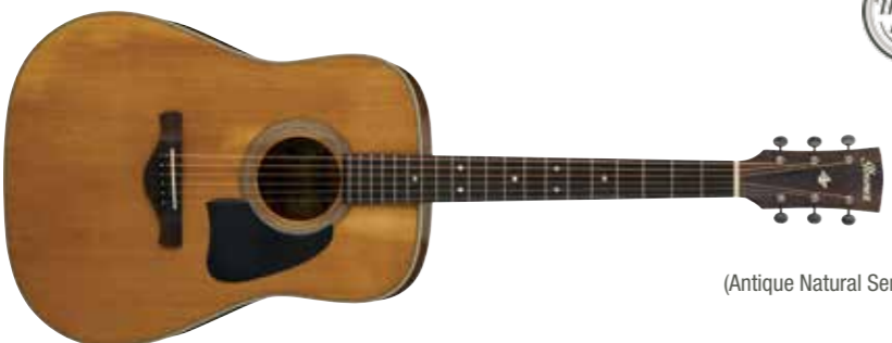
ANS (Antique Natural Semi-Gloss)