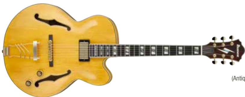
AA (Antique Amber)