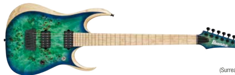
SBB (Surreal Blue Burst)