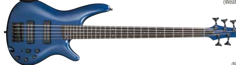
NM (Navy Metallic) NEW FINISH