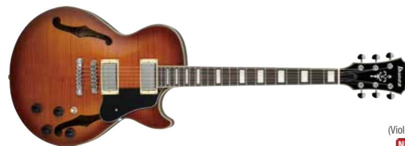
VLS (Violin Sunburst) NEW FINISH