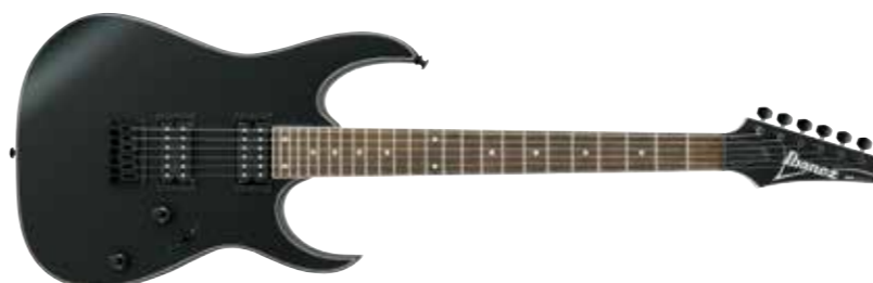
BKF (Black Flat)