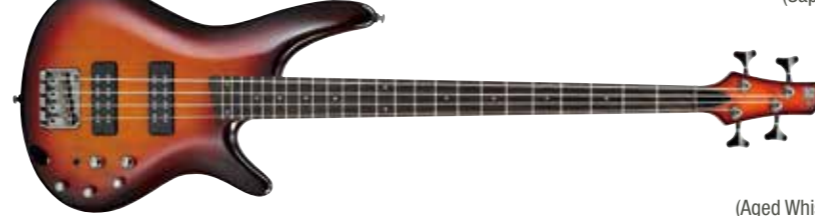
AWB (Aged Whiskey Burst)