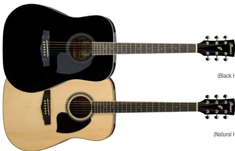
BK (Black High Gloss)