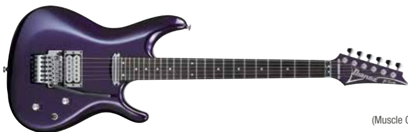
MCP (Muscle Car Purple)