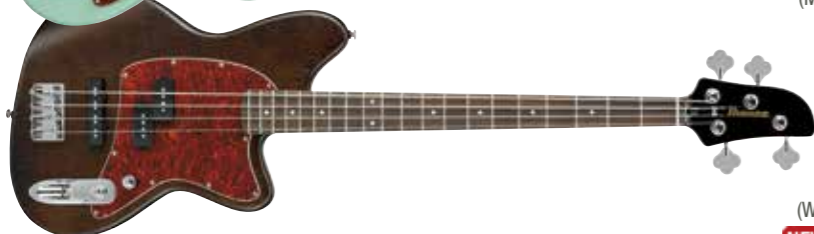
WNF (Walnut Flat)