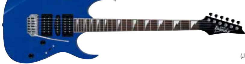
JB (Jewel Blue)