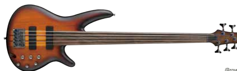
BBF (Brown Burst Flat)