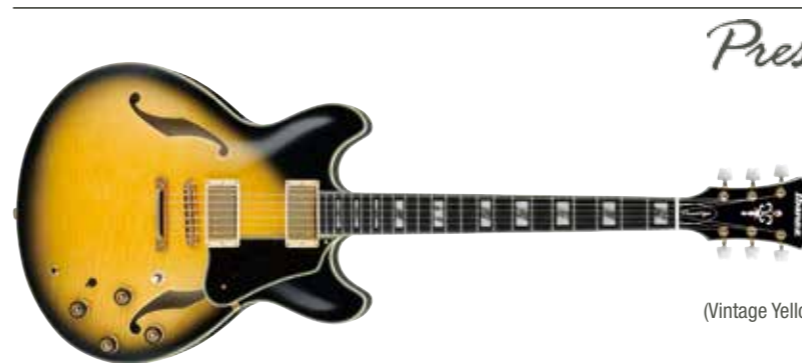
VYS (Vintage Yellow Sunburst)