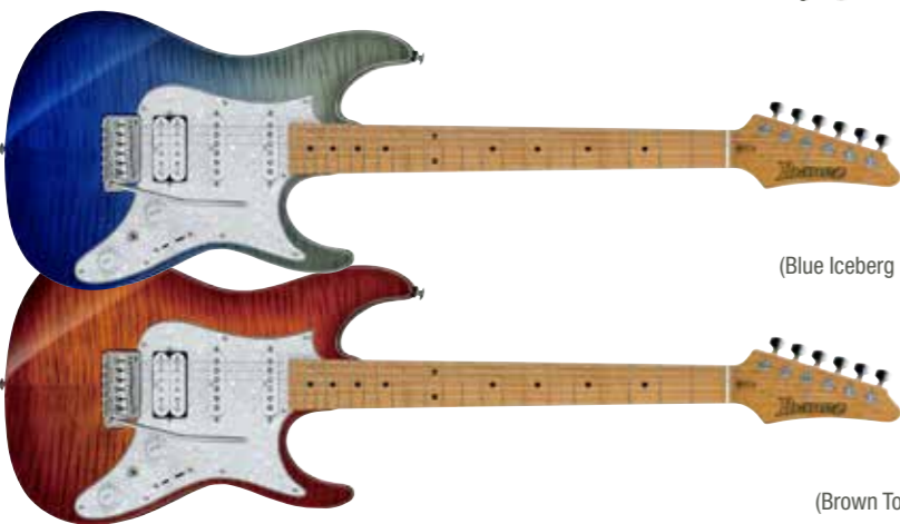
BIG (Blue Iceberg Gradation)