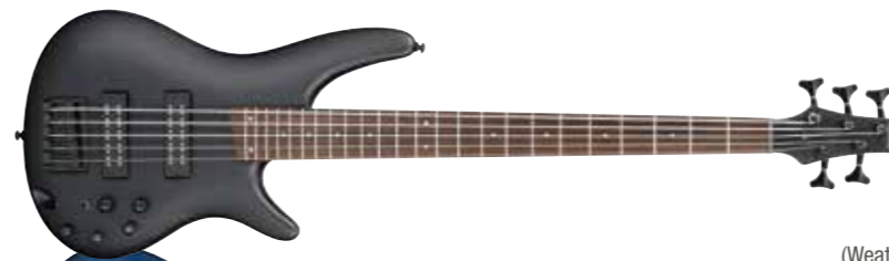
WK (Weathered Black)