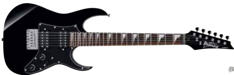
BKN (Black Night)