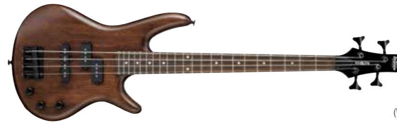
WNF (Walnut Flat)