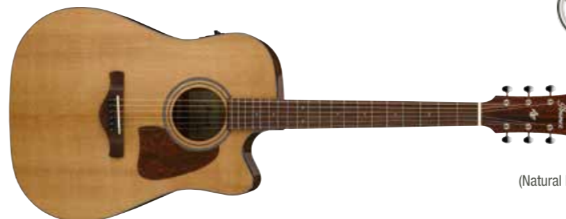
NT (Natural High Gloss)