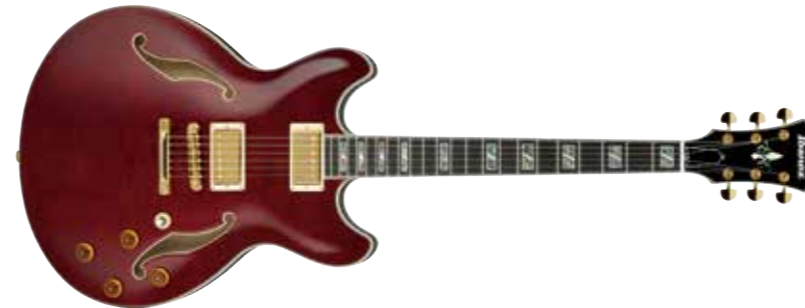
WRD (Wine Red)