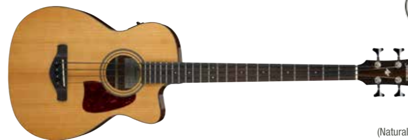
NT (Natural High Gloss)