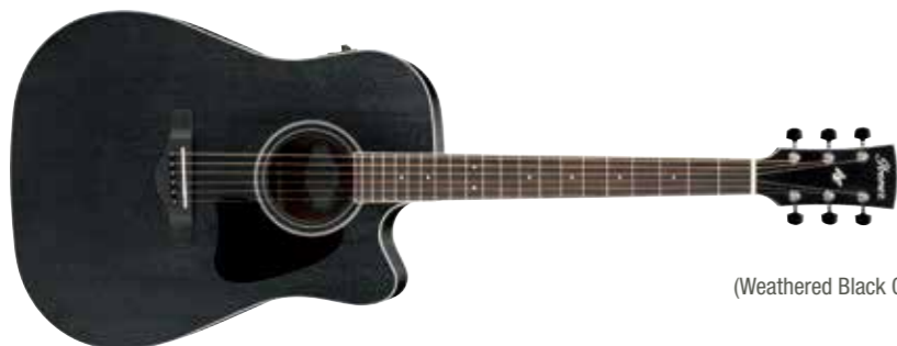
WK (Weathered Black Open Pore)