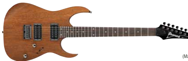
MOL (Mahogany Oil)