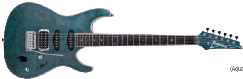
ABT (Aqua Blue Flat)