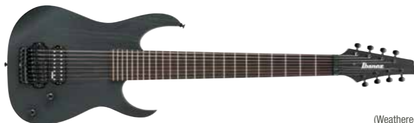
WK (Weathered Black)