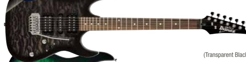
TKS (Transparent Black Sunburst)