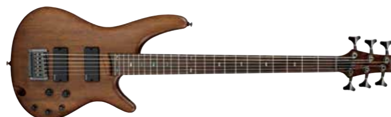
WNF (Walnut Flat)