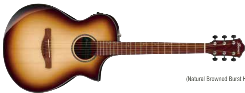
NNB (Natural Browned Burst High Gloss)