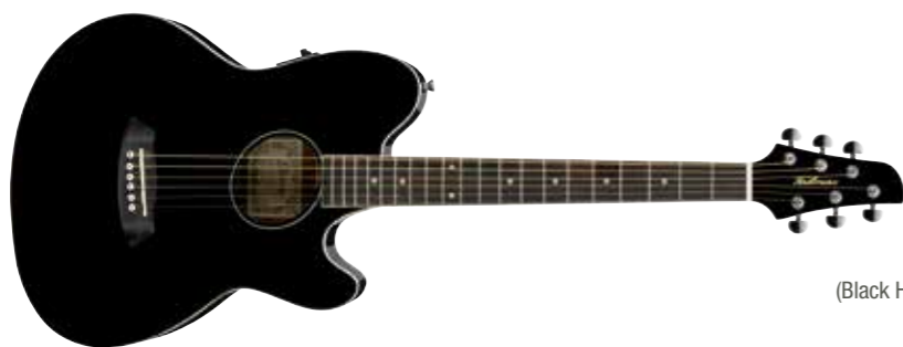
BK (Black High Gloss)