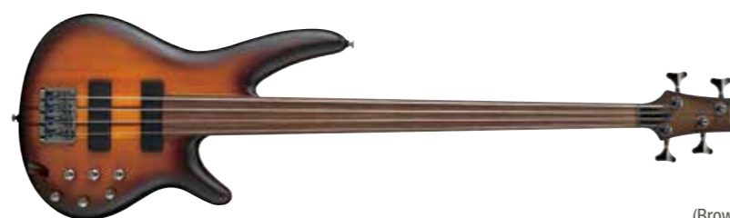
BBF (Brown Burst Flat)