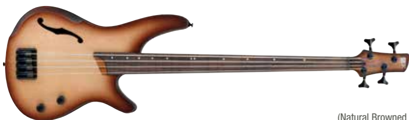
NNF (Natural Browned Burst Flat)