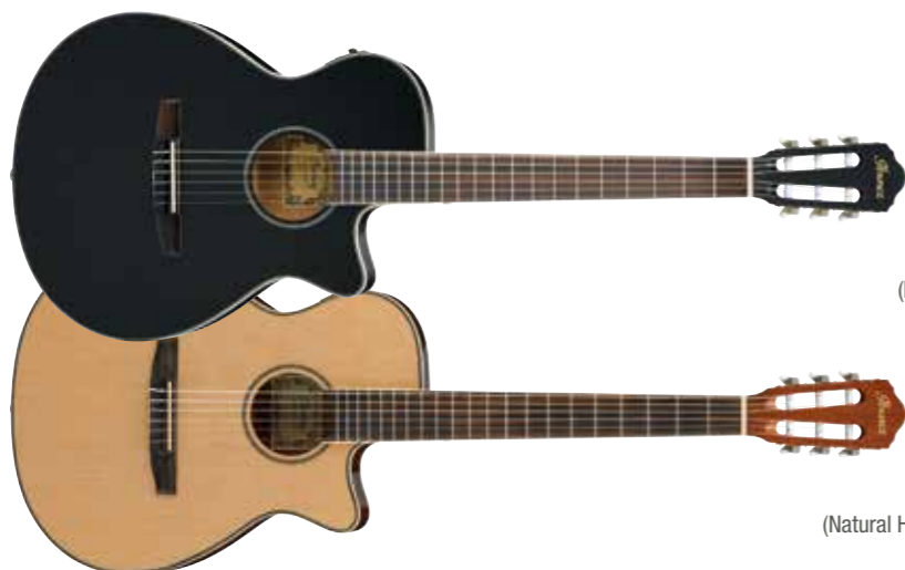
BKF (Black Flat)