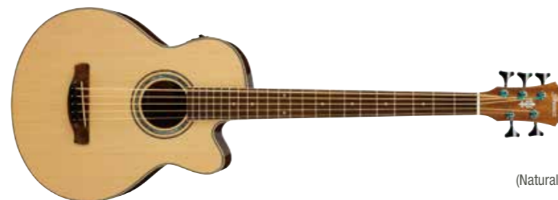
NT (Natural High Gloss)