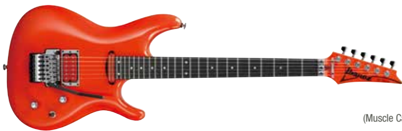
MCO (Muscle Car Orange)