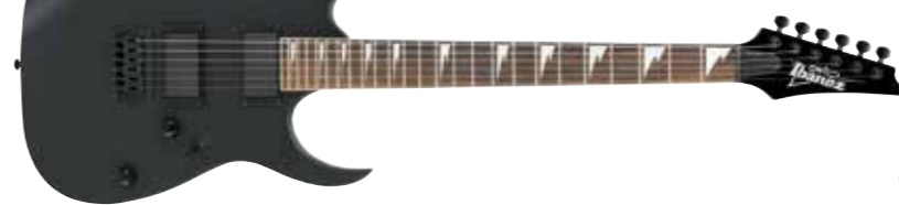
BKF (Black Flat)