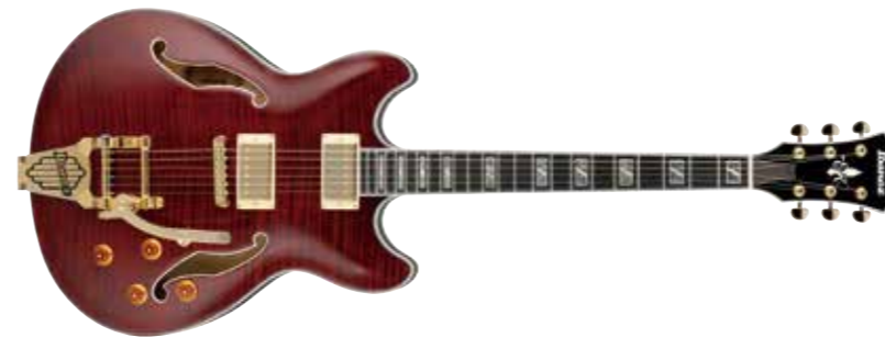
WRD (Wine Red)