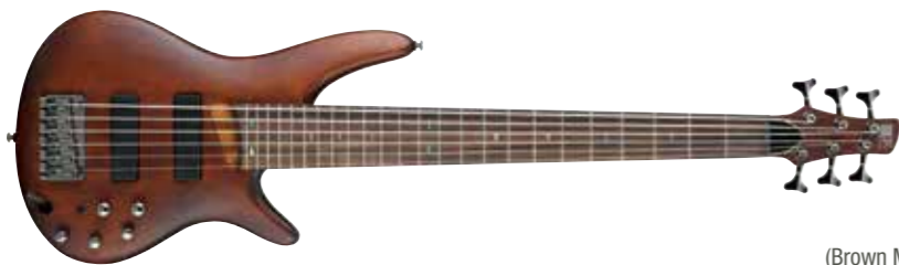
BM (Brown Mahogany)