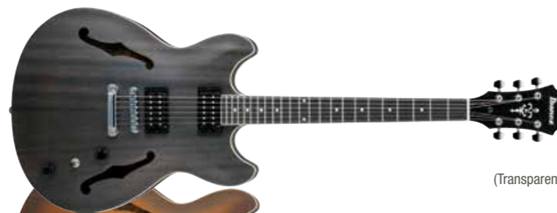
TKF (Transparent Black Flat)