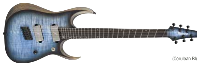
CLF (Cerulean Blue Burst Flat)