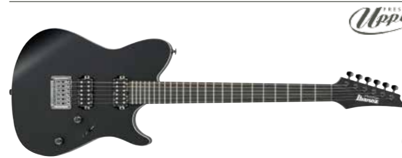
BKF (Black Flat)