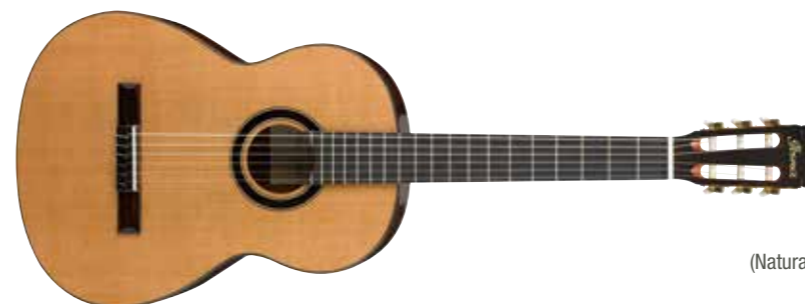
NT (Natural High Gloss)