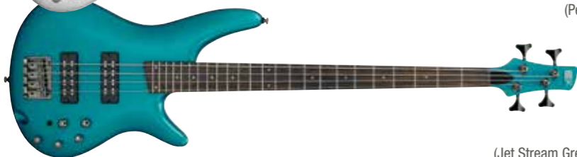
JSM (Jet Stream Green Matte) NEW FINISH