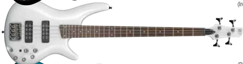
PW (Pearl White)