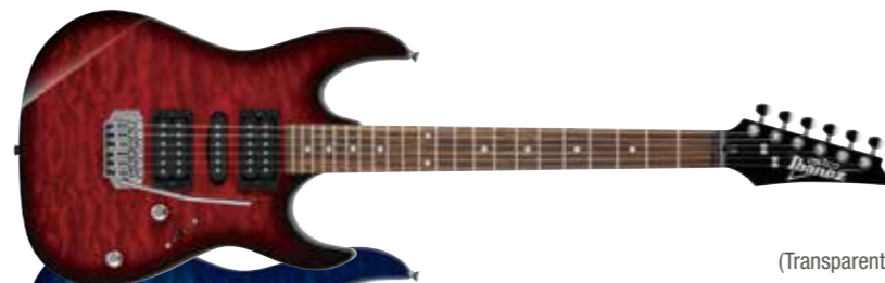
TRB (Transparent Red Burst)