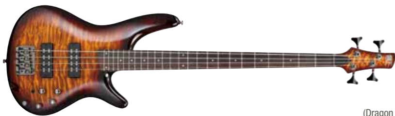
DEB (Dragon Eye Burst)