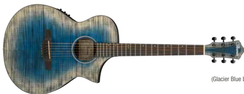
GBL (Glacier Blue Low Gloss)