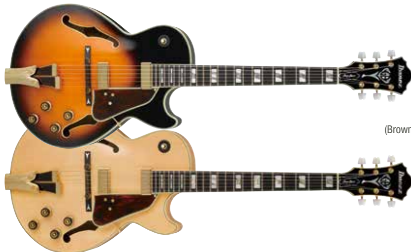
BS (Brown Sunburst)