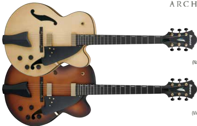
NTF (Natural Flat)