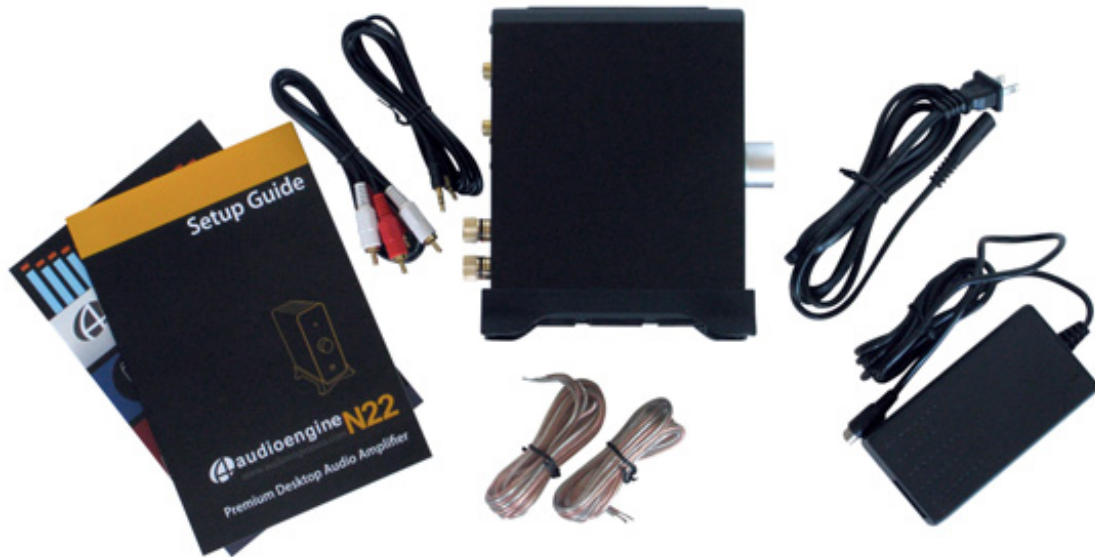
The N22 and all its accessories

It's always a treat to listen to your favorite music on a set of speakers as well balanced as the P4s as they tend to bring forward instruments that have a tendency to get buried. It really can breathe new life into songs you've heard a hundred times. In our tests, the N22 and P4 combo produces very clear, very accurate sound across a very broad and eclectic range of music. Even our pipe organ enthusiast was pleased with the sound, which is saying something. At full volume (which is uncomfortably loud in a small to mid-sized room) the sound DID feel just a bit thin, although in general we were impressed with the bass the system was able to deliver. If anything is lacking in the N22/P4 combo (and not much is), it's that with certain songs I felt the sound could use just a bit more "presence", for lack of a better term. However, that might be me asking more than a bookshelf system is meant to deliver on its own, which is where the S8 comes in.