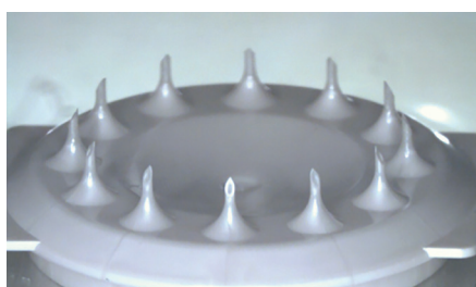
Figure 3: 3M Hollow Microstructured Transdermal System, pPolymer microneedle array with 12 hollow microneedles, each approximately 1500 µm.

3MHollowMicrostructuredTransdermal System is designed for intradermal delivery of liquid formulations, including biologics, such as proteins and peptides, in addition to small molecules. Hollow microneedles have the flexibility to deliver up to 2 mL of high value biologic formulations. 1,2,3 This system also provides relatively fast delivery of a high volume of a liquid drug formulation. 3M Hollow Microstructured Transdermal System array is a 1 cm 2 polymeric disk composed of hollow microneedles with a sterile flow path connected to a conventional glass cartridge. During application, the microneedles are inserted into the skin penetrating the stratum corneum and epidermis, and creating direct access to the dermis. This hollow microneedle array, as demonstrated in Figure 3, is made from medical grade polymer with 12 microneedles 1500 µm tall. Delivery of the formulation through hollow