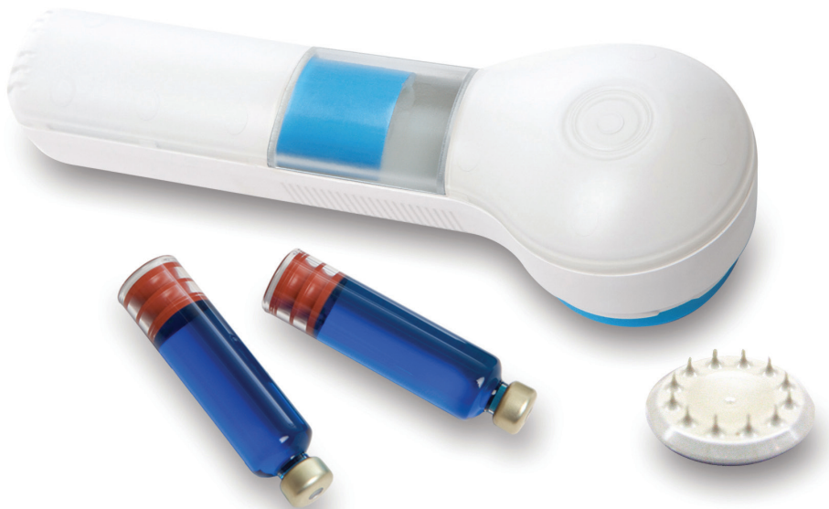
Figure 5: The 3M Hollow Microstructure Transdermal System device.

low regulatory requirements for patient-centric design and self-administration considerations.