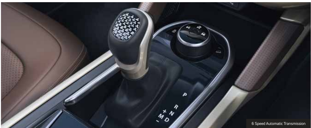
6 Speed Automatic Transmission

Redefine exhilaration with Harrier's sheer power, that lets you glide through city roads and rock your adventures alike! The all-new 6 speed Automatic Transmission lets you experience driving pleasure like never before.