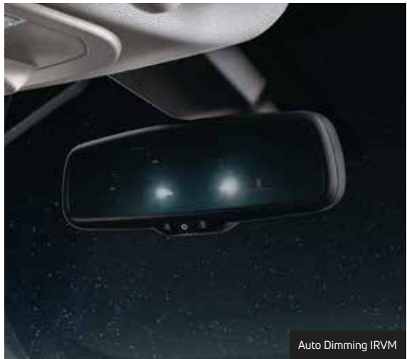
Auto Dimming IRVM