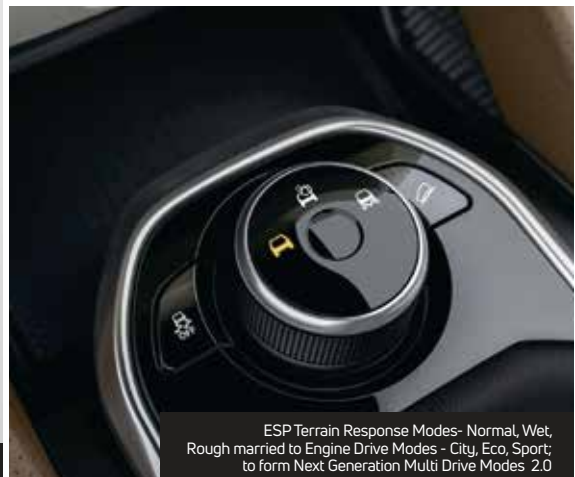
ESP Terrain Response Modes- Normal, Wet, Rough married to Engine Drive Modes - City, Eco, Sport; to form Next Generation Multi Drive Modes 2.0