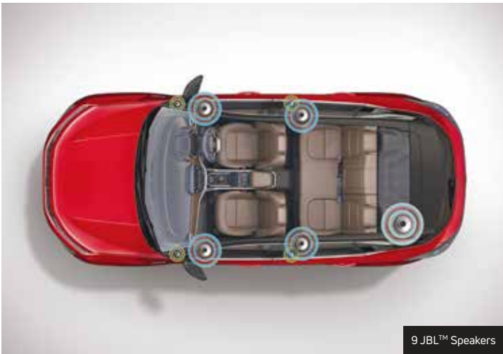
9 JBL™ Speakers