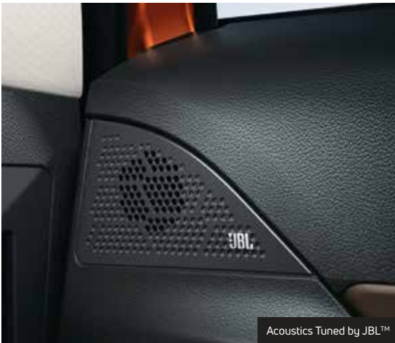
Acoustics Tuned by JBL™