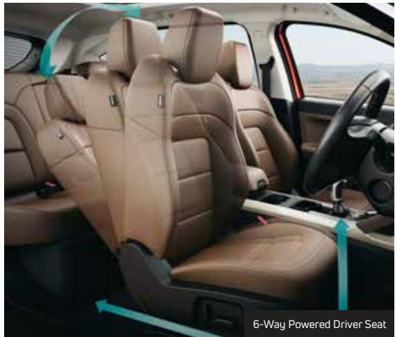
6-Way Powered Driver Seat