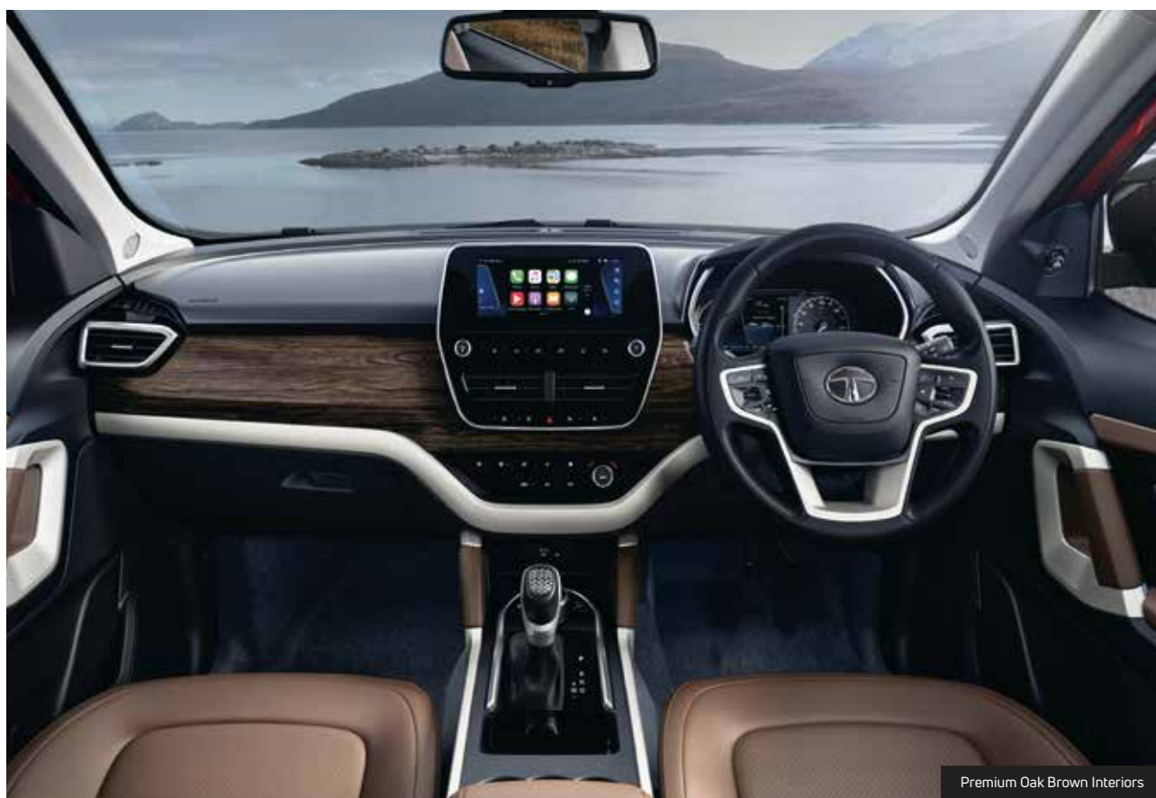
Premium Oak Brown Interiors

An extraordinary exterior design lends the Harrier its imposing stance. Its thoughtfully designed plush interiors allow you to enjoy comfort at its finest; with leather seat upholstery, and signature oak brown interiors that are a class apart. With its all new look, you can only expect to turn more heads as you go!