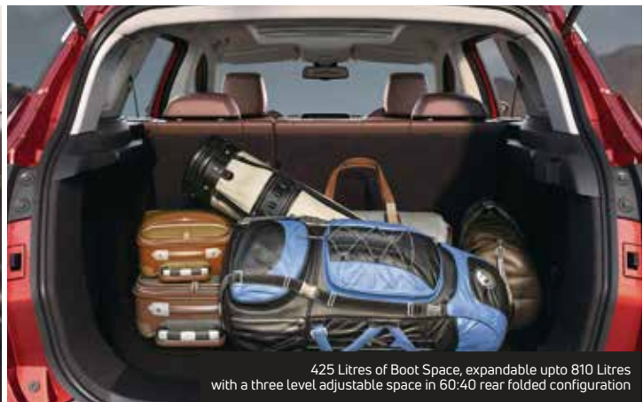
425 Litres of Boot Space, expandable upto 810 Litres with a three level adjustable space in 60:40 rear folded configuration