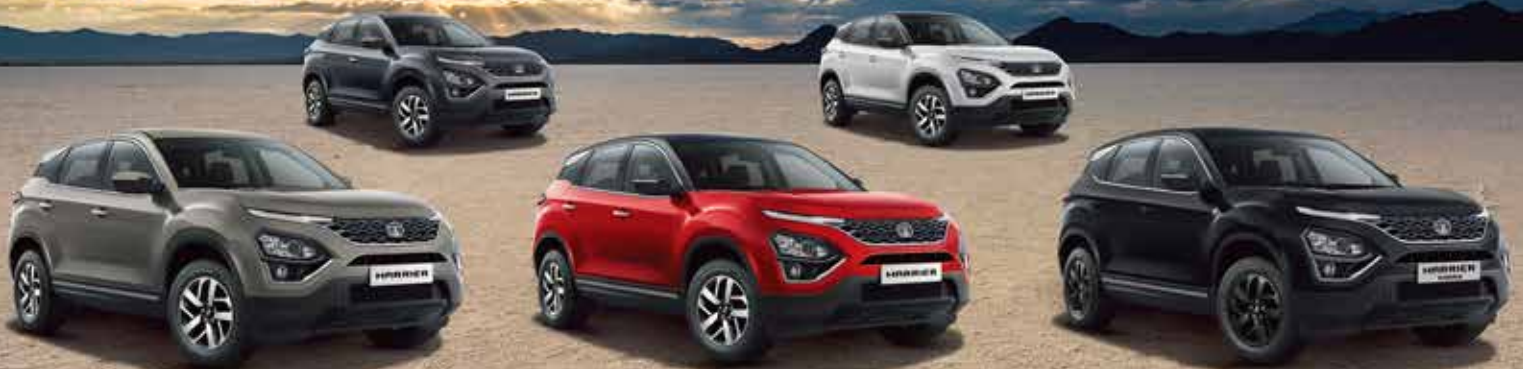
L-R: Sparkle Cocoa, Teleso Grey, Calypso Red, Orcus White and Atlas Black- #Dark

Personalize your style with our dynamic colour range, that further accentuates Harrier's powerful stance. A palette that delivers a vibrant range of options for your adventures, is sure to catch the eye. So, what's your style?