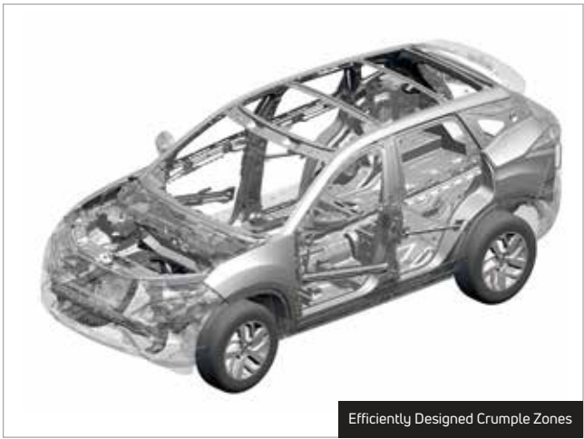
Efficiently Designed Crumple Zones