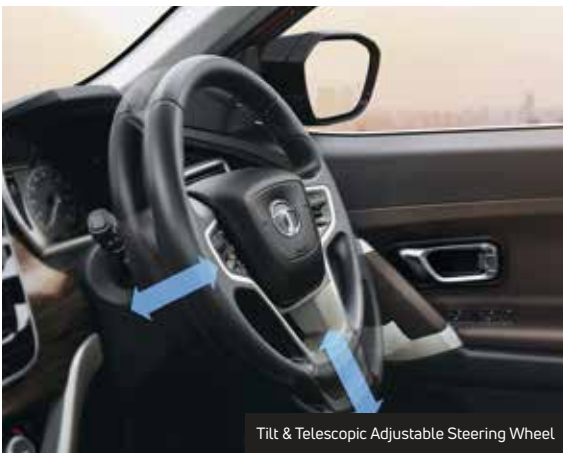
Tilt & Telescopic Adjustable Steering Wheel