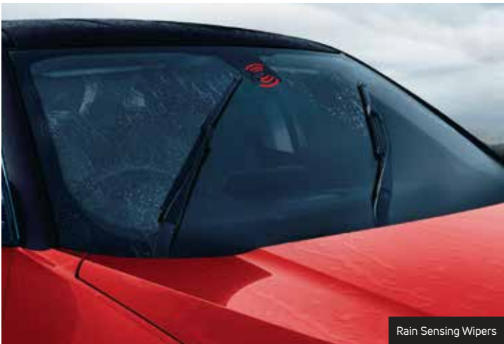
Rain Sensing Wipers