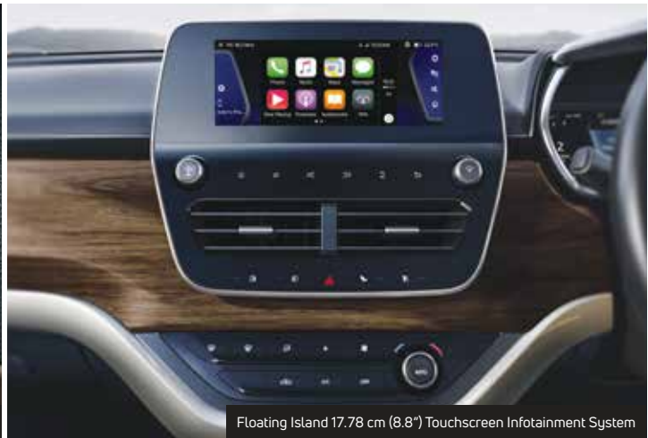
Floating Island 17.78 cm (8.8") Touchscreen Infotainment System