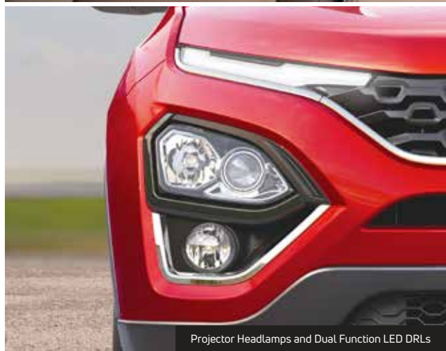
Projector Headlamps and Dual Function LED DRLs