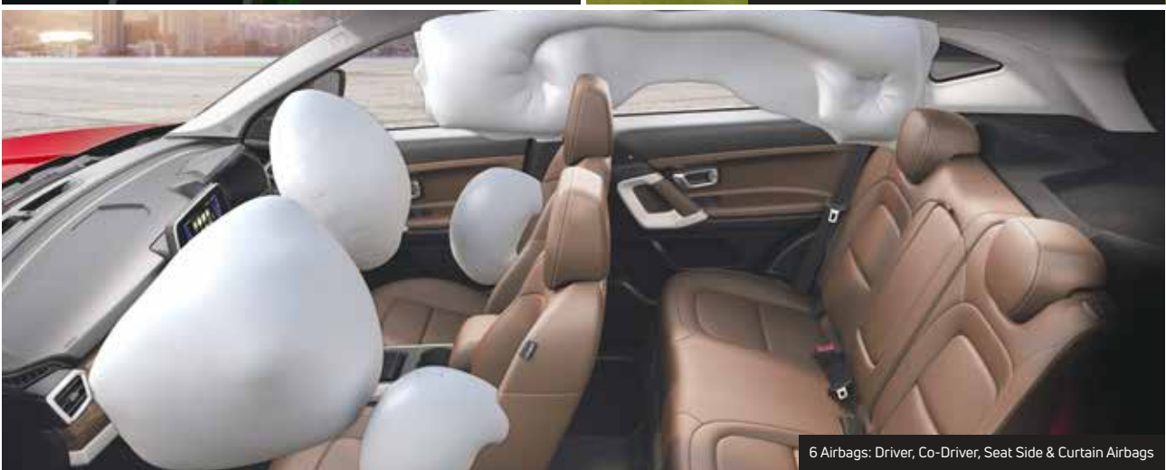
6 Airbags: Driver, Co-Driver, Seat Side & Curtain Airbags