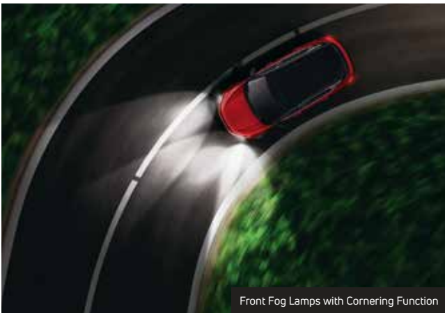
Front Fog Lamps with Cornering Function