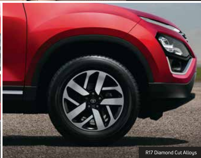
R17 Diamond Cut Alloys