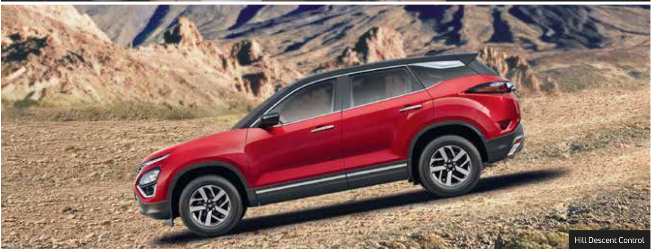
Hill Descent Control