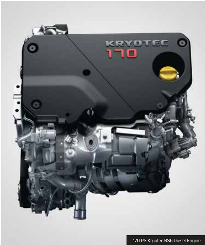
170 PS Kryotec BS6 Diesel Engine