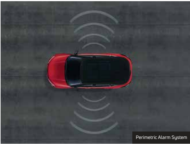
Perimetric Alarm System