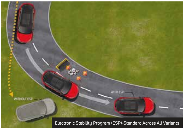
Electronic Stability Program (ESP)-Standard Across All Variants