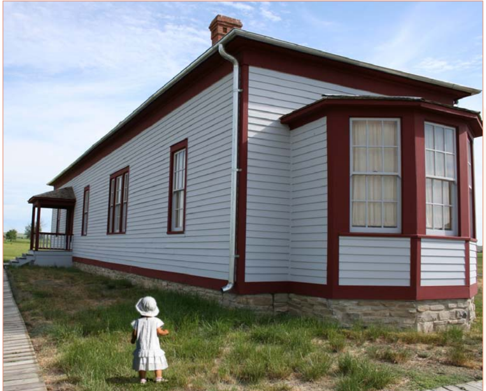
A young visitor pauses outside the Fort Buford museum, above. Below, the cemetery is located southwest of the fort.

Today, visitors can see three original buildings: the stone powder magazine, the officer of the guard building, and the officers' quarters, which houses an interpretive exhibit of the fort's story. Another point of interest is the cemetery, just southwest of the fort. All buried military personnel were moved to Little Bighorn Battlefield National Monument in Montana, however, civilian graves were left undisturbed and likely still contain the remains of