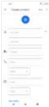
Contact information field

Note: You may add individual contacts to any of the home screens by entering the contacts menu, clicking on the specific contact, pressing menu, and then selecting the 'Add to home screen' option. You can also share