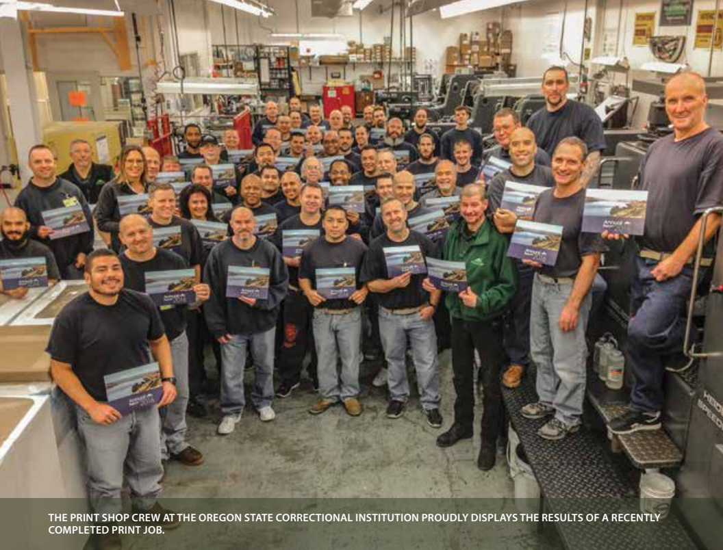
THE PRINT SHOP CREW AT THE OREGON STATE CORRECTIONAL INSTITUTION PROUDLY DISPLAYS THE RESULTS OF A RECENTLY COMPLETED PRINT JOB.