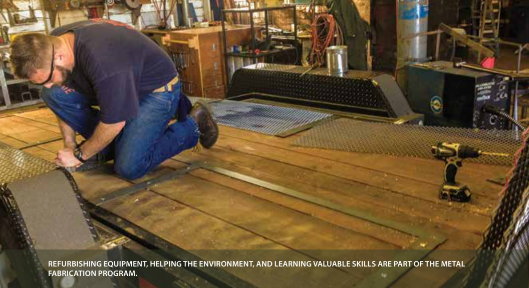
REFURBISHING EQUIPMENT, HELPING THE ENVIRONMENT, AND LEARNING VALUABLE SKILLS ARE PART OF THE METAL FABRICATION PROGRAM.