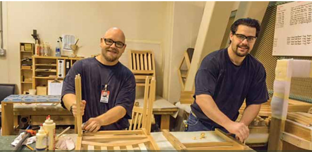
THESE AICs HAPPILY DEMONSTRATE THE TEAMWORK AND PRODUCT ASSEMBLY SKILLS TAUGHT IN OCE PROGRAMS.

From meticulous quality control measures to the final shipping techniques, OCE workers learn the skills necessary to prepare them for real-world work in office and reception seating manufacturing.