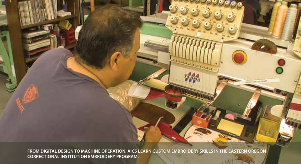
FROM DIGITAL DESIGN TO MACHINE OPERATION, AICS LEARN CUSTOM EMBROIDERY SKILLS IN THE EASTERN OREGON CORRECTIONAL INSTITUTION EMBROIDERY PROGRAM.