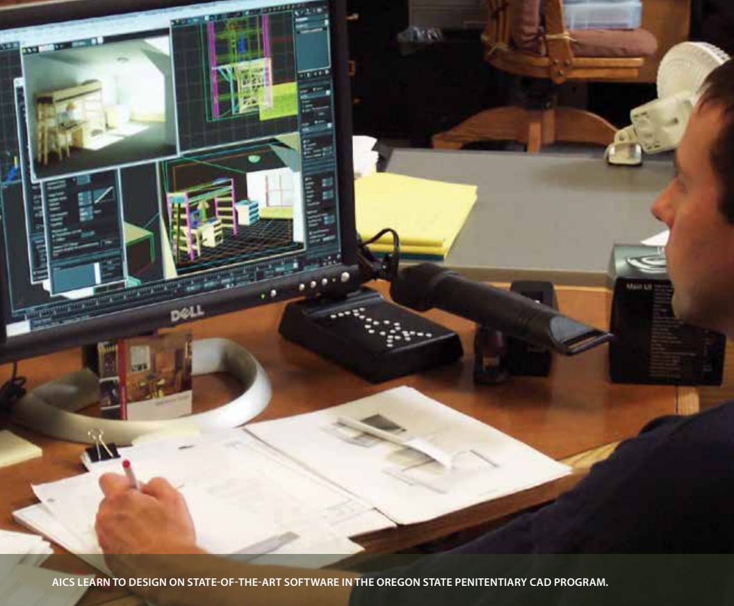
AICS LEARN TO DESIGN ON STATE-OF-THE-ART SOFTWARE IN THE OREGON STATE PENITENTIARY CAD PROGRAM.