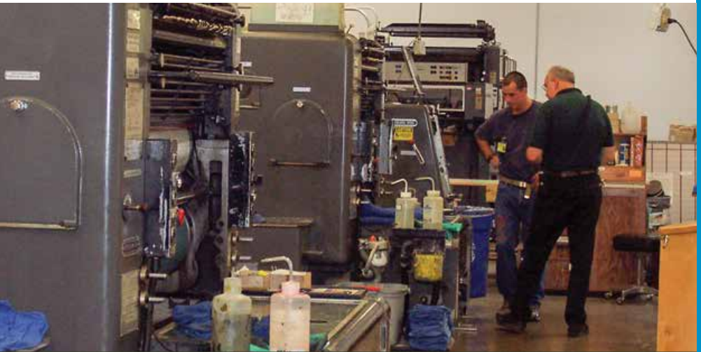
STAFF AND AICs WORK TOGETHER TO SOLVE PROBLEMS AND KEEP THE SHOPS RUNNING SMOOTHLY.