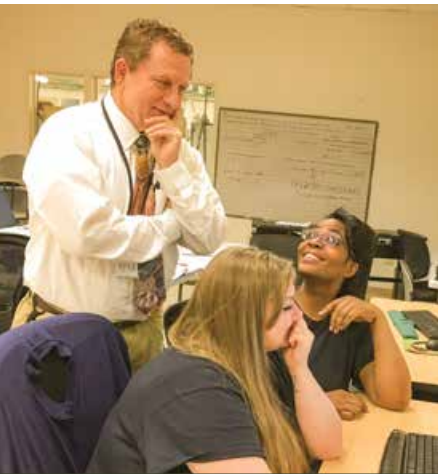
COMMUNITY PARTNERS FACILITATE SUCCESSFUL OUTCOMES FOR AICs THROUGH DIRECT INSTRUCTION.