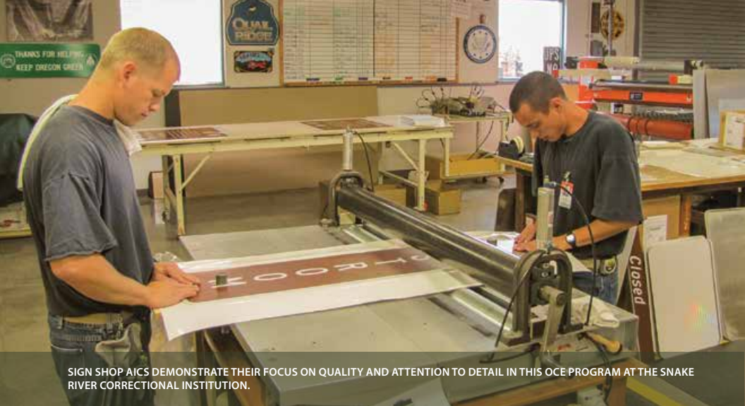
SIGN SHOP AICS DEMONSTRATE THEIR FOCUS ON QUALITY AND ATTENTION TO DETAIL IN THIS OCE PROGRAM AT THE SNAKE RIVER CORRECTIONAL INSTITUTION.