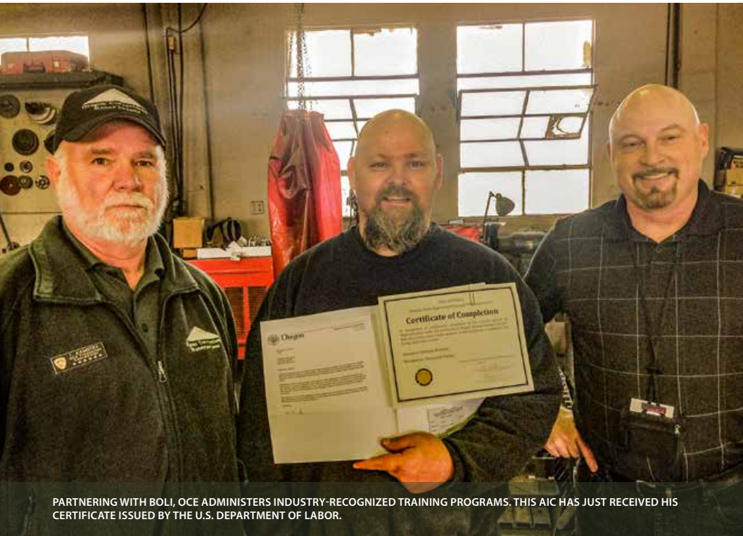
PARTNERING WITH BOLI, OCE ADMINISTERS INDUSTRY-RECOGNIZED TRAINING PROGRAMS. THIS AIC HAS JUST RECEIVED HIS CERTIFICATE ISSUED BY THE U.S. DEPARTMENT OF LABOR.