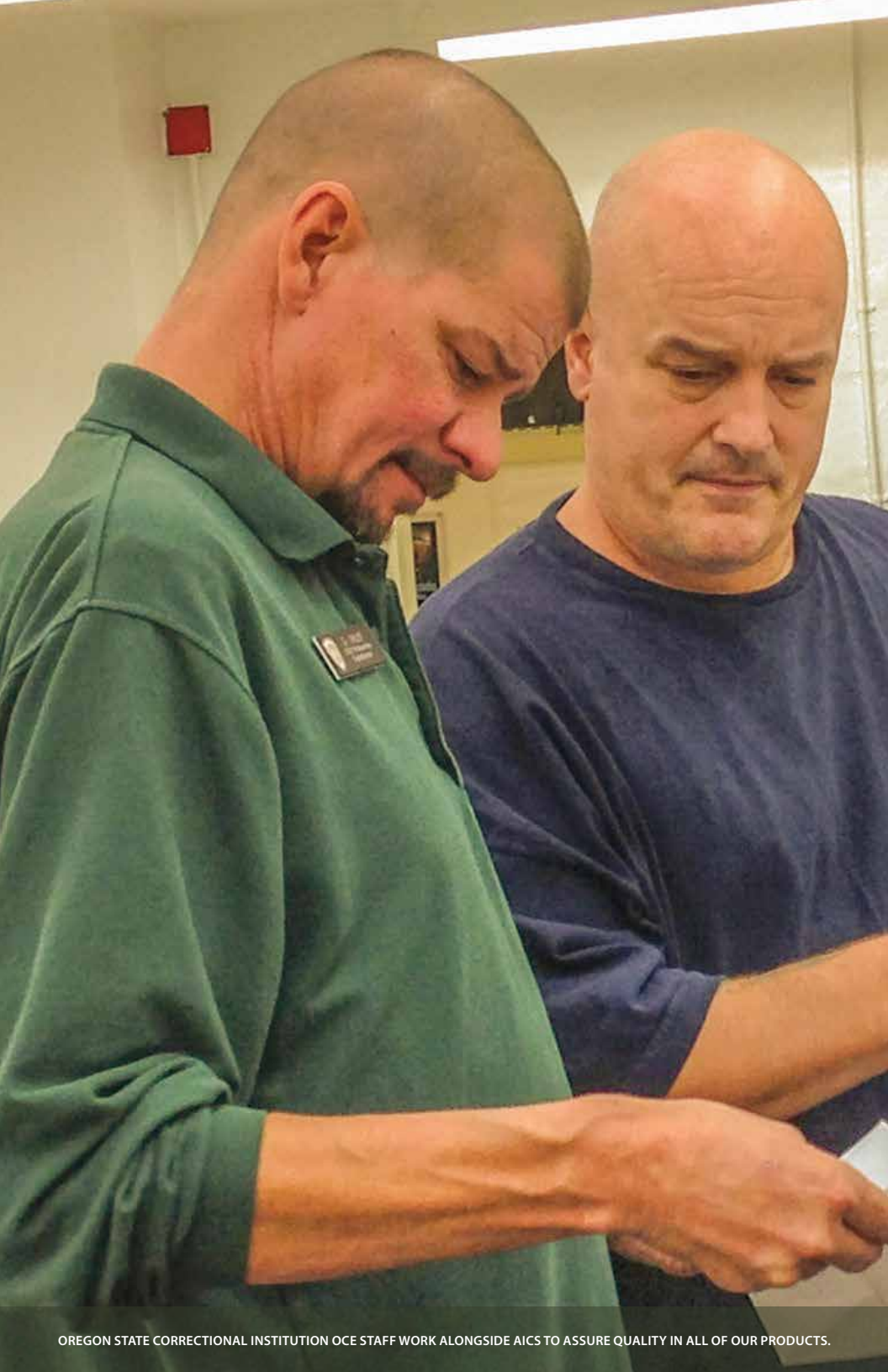
OREGON STATE CORRECTIONAL INSTITUTION OCE STAFF WORK ALONGSIDE AICS TO ASSURE QUALITY IN ALL OF OUR PRODUCTS.