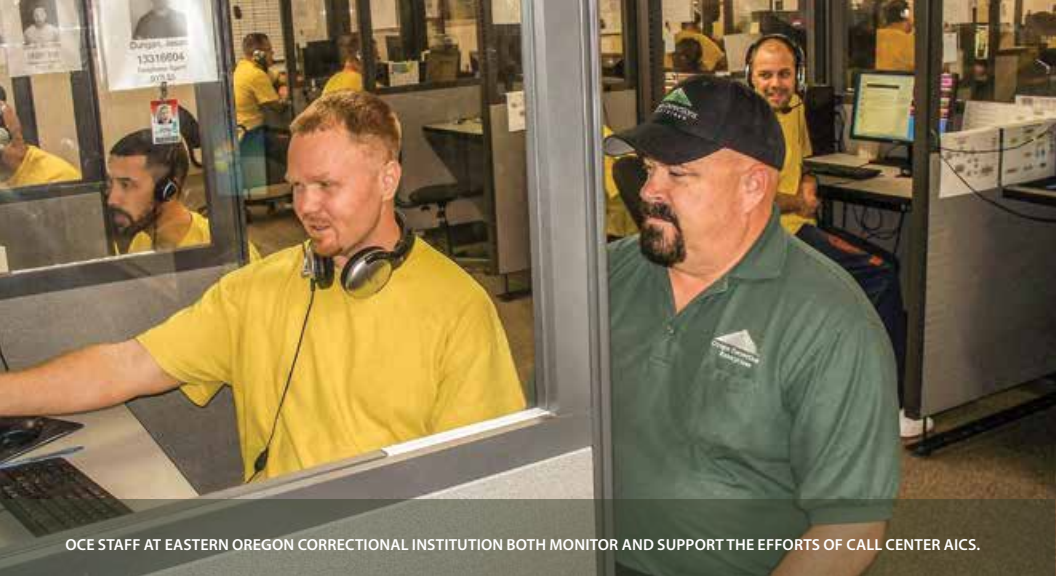
OCE STAFF AT EASTERN OREGON CORRECTIONAL INSTITUTION BOTH MONITOR AND SUPPORT THE EFFORTS OF CALL CENTER AICS.