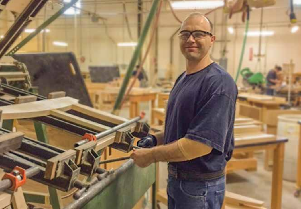
AICS LEARN REAL-WORLD SKILLS IN OCE PROGRAMS, INCLUDING PROPER JOINERY AND GLUING TECHNIQUES, IN THE WOOD SHOP AT TWO RIVERS CORRECTIONAL INSTITUTION.