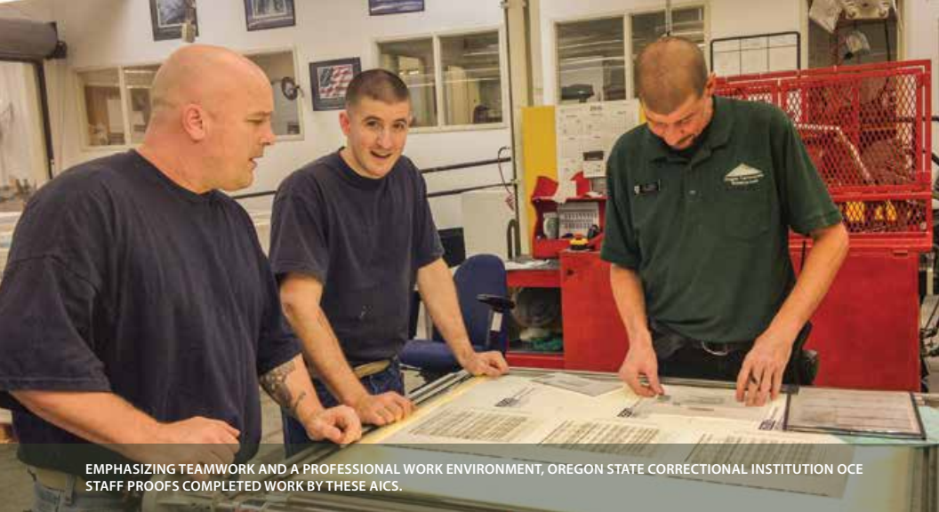
EMPHASIZING TEAMWORK AND A PROFESSIONAL WORK ENVIRONMENT, OREGON STATE CORRECTIONAL INSTITUTION OCE STAFF PROOFS COMPLETED WORK BY THESE AICS.