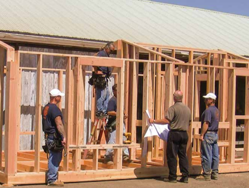
AICS GAIN VALUABLE RE-ENTRY SKILLS BY LEARNING TO BUILD PRODUCTS LIKE THESE CABINS FOR THE PARKS AND RECREATION DEPARTMENT.