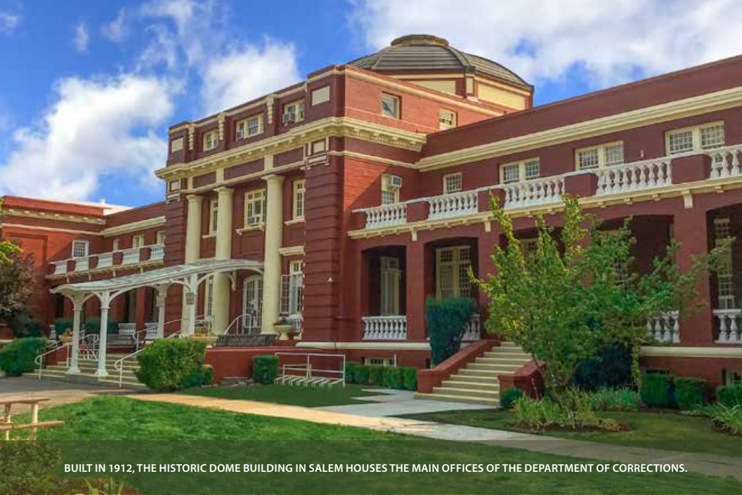
BUILT IN 1912, THE HISTORIC DOME BUILDING IN SALEM HOUSES THE MAIN OFFICES OF THE DEPARTMENT OF CORRECTIONS.