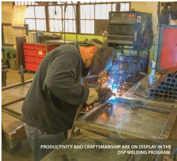
PRODUCTIVITY AND CRAFTSMANSHIP ARE ON DISPLAY IN THE OSP WELDING PROGRAM.