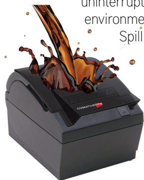
A798II with Spill Guard Accessory

The A798II was designed to withstand conditions in normal retail and hospitality environments where damage can occur. Designed with a liquid dam and unique drainage features, the A798II offers uninterrupted printing. For harsher environments, we also offer an optional Spill Guard accessory.