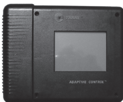
Figure 1 - Operator interface