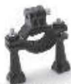
Handle Bar/ Pole Mount