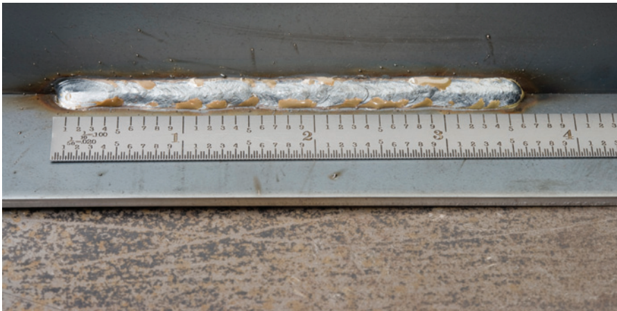
Fig. 4 — The heat input is calculated by taking the final energy value and dividing it by the length of the weld.

the amount of energy that went into that weld, from arc start to arc stop.