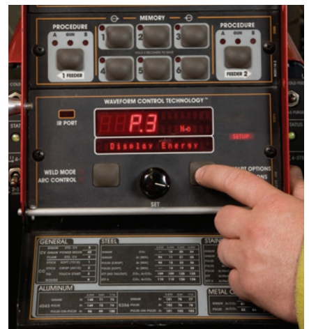
Fig. 2 — With the proper software installed, access to the energy reading entails pressing the menu option "Display Energy."

To use method (c) of the code, a reading of energy (Joules) or power (Joules/s) must be obtained using a meter that captures the brief changes in a welding waveform and filters out extraneous noise. The simplest place to obtain this is from the welding power source. Many power sources that output pulsing waveforms will display these readings, although some might require software upgrades to enable this. Details and software upgrades for Lincoln Electric's Powerwave "M" series and several other models are available free of charge at www.powerwave.com . For a power source that