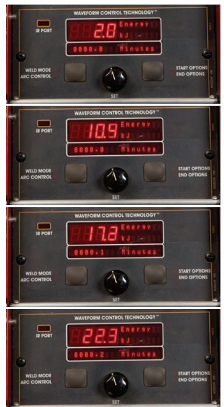
Fig. 3 — The real-time energy is continuously incremented while welding, and the final energy is displayed until the next arc start.

doesn't support the display of energy or power, external meters are available. A meter with demonstrated accuracy in this application is the Fluke® 345 Power Quality Clamp Meter.