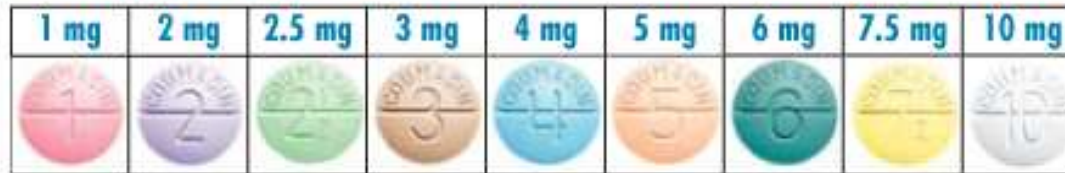
COUMADIN® (warfarin sodium)