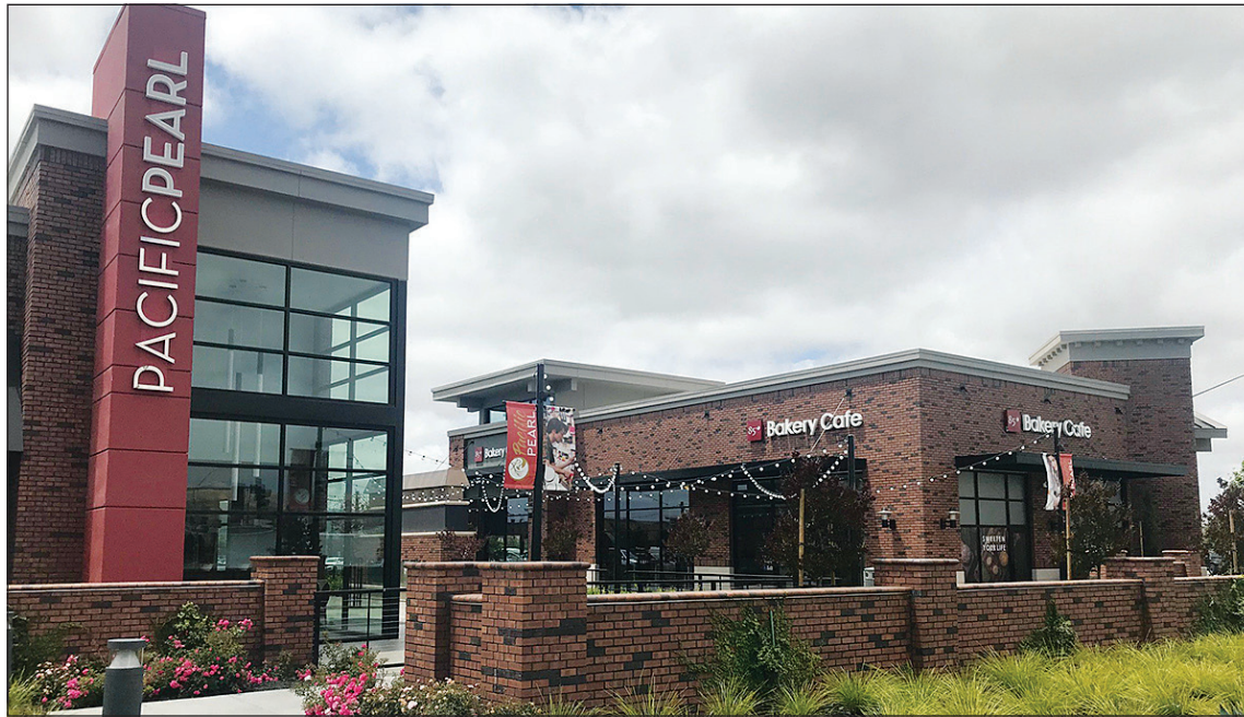
The Pacific Pearl Shopping Center is located in Pleasanton at the corner of Stoneridge Drive and El Charro, diagonal from the outlets.

ers, restaurants and service providers already open or soon to open at Pacific Pearl with more announcements to come. A few of the center's most recent additions include: 99 Ranch Market, Brilliant Minds Academy, Poke Moana, Kura Revolving Sushi Bar, East Bay Vision Optometry Center and Pure Organic Nail Salon. Each of the center's new tenants exemplify the careful selection process Pacific