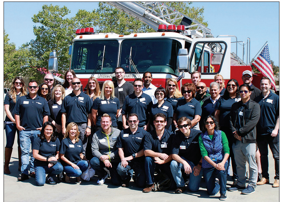
Leadership Pleasanton Class of 2018

Class size is limited to 30 participants. Those interested in finding out about community involvement or enriching their current level of participation are encouraged to apply. Curriculum information and applications are available on the Chamber website at www.pleasanton.org/leadership-pleasanton and at the Chamber office, 777 Peters Avenue, in downtown Pleasanton. For more information on Leadership Pleasanton, contact the Chamber at (925) 846-5858 ext. 203 or email kate@pleasanton.org .