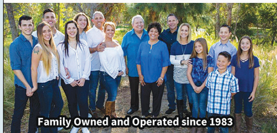
Family Owned and Operated since 1983

Family-owned and currently operated three generations strong.