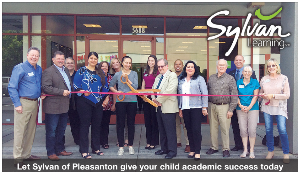
Let Sylvan of Pleasanton give your child academic success today

The Coop — The COOP is the coolest play and party space for kids, and adults love it too. Your kids will play for hours in our giant ball pit, the two-story curly slide, a super cool rope climbing tunnel, the jumbo bouncer equipped with a basketball net for “kid-friendly” dunking, pow wow in our COOP teepee, or play and dance the day away on the electronic dance and gaming floor. At the COOP, we pride ourselves on hosting fun, unique, and creative birthday parties. We offer a variety of different birthday themes to choose from so you can select what best fits your child’s wishes. You can do it all on your own, or sit back, relax, and let us do it all for you. The COOP also hosts terrific baby showers, mommy group parties, school events, fundraisers, holiday parties and more. Now open at 3059-D Hopyard Road in Pleasanton. Learn more at www.thecooppleasanton.com .