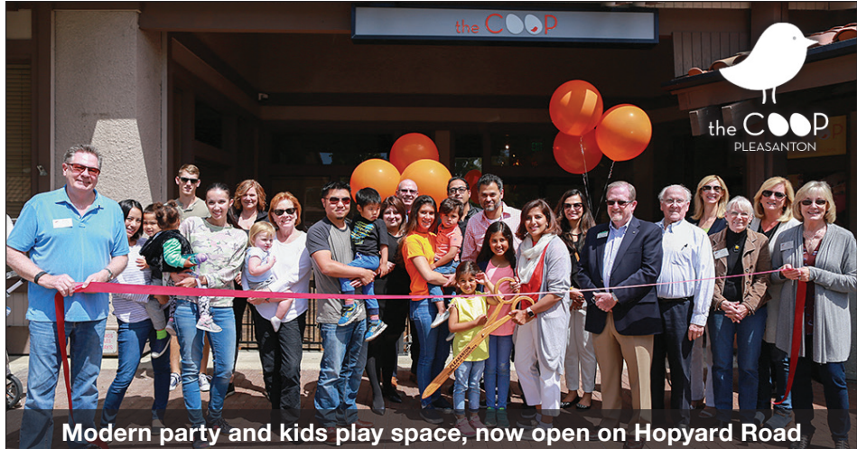
Modern party and kids play space, now open on Hopyard Road

The Coop — The COOP is the coolest play and party space for kids, and adults love it too. Your kids will play for hours in our giant ball pit, the two-story curly slide, a super cool rope climbing tunnel, the jumbo bouncer equipped with a basketball net for “kid-friendly” dunking, pow wow in our COOP teepee, or play and dance the day away on the electronic dance and gaming floor. At the COOP, we pride ourselves on hosting fun, unique, and creative birthday parties. We offer a variety of different birthday themes to choose from so you can select what best fits your child’s wishes. You can do it all on your own, or sit back, relax, and let us do it all for you. The COOP also hosts terrific baby showers, mommy group parties, school events, fundraisers, holiday parties and more. Now open at 3059-D Hopyard Road in Pleasanton. Learn more at www.thecooppleasanton.com .