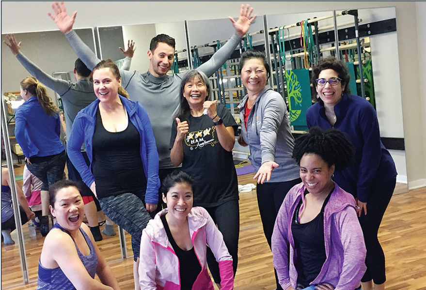
Breckenridge Dance and Fitness offers group classes with no more than 10 people in class, allowing individual correction and attention while benefiting from the energy of the group.