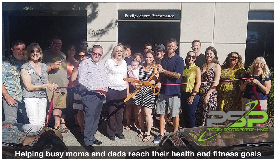
Helping busy moms and dads reach their health and fitness goals

Sylvan Learning Center — Sylvan Learning Center is proud to re-open its doors after relocating to its new center at 5688 Stoneridge Drive in Pleasanton. Sylvan has been a trusted name for kindergarten thru grade 12 tutoring for nearly 40 years. From math, to reading, to SAT prep, to fun, interactive camps, Sylvan is focused on building academic confidence, igniting intellectual curiosity and inspiring a love for learning. Sylvan is the largest provider of STEM programs in North America. They’re on a mission to engage kids in fun STEM programs today, so they become our leaders of tomorrow. Call today at 925-485-1000 to schedule a free assessment and watch your child’s confidence soar.