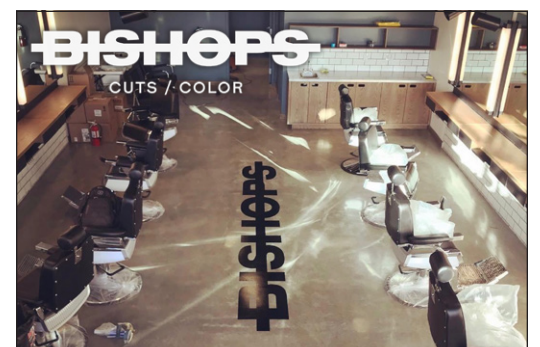
Bishops Pleasanton will have a grand opening on Saturday, July 28.

can be reached at 925-201-3487. Follow them on Instagram at bishops.pleasanton/ or like them on Facebook at www.facebook.com/bishops.pleasanton/ .