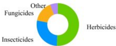
2020 Net Sales by Product Line