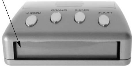
Magnetic contacts underneath