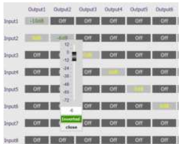
Advanced Matrix Mixer for Rear Fill/Center effect