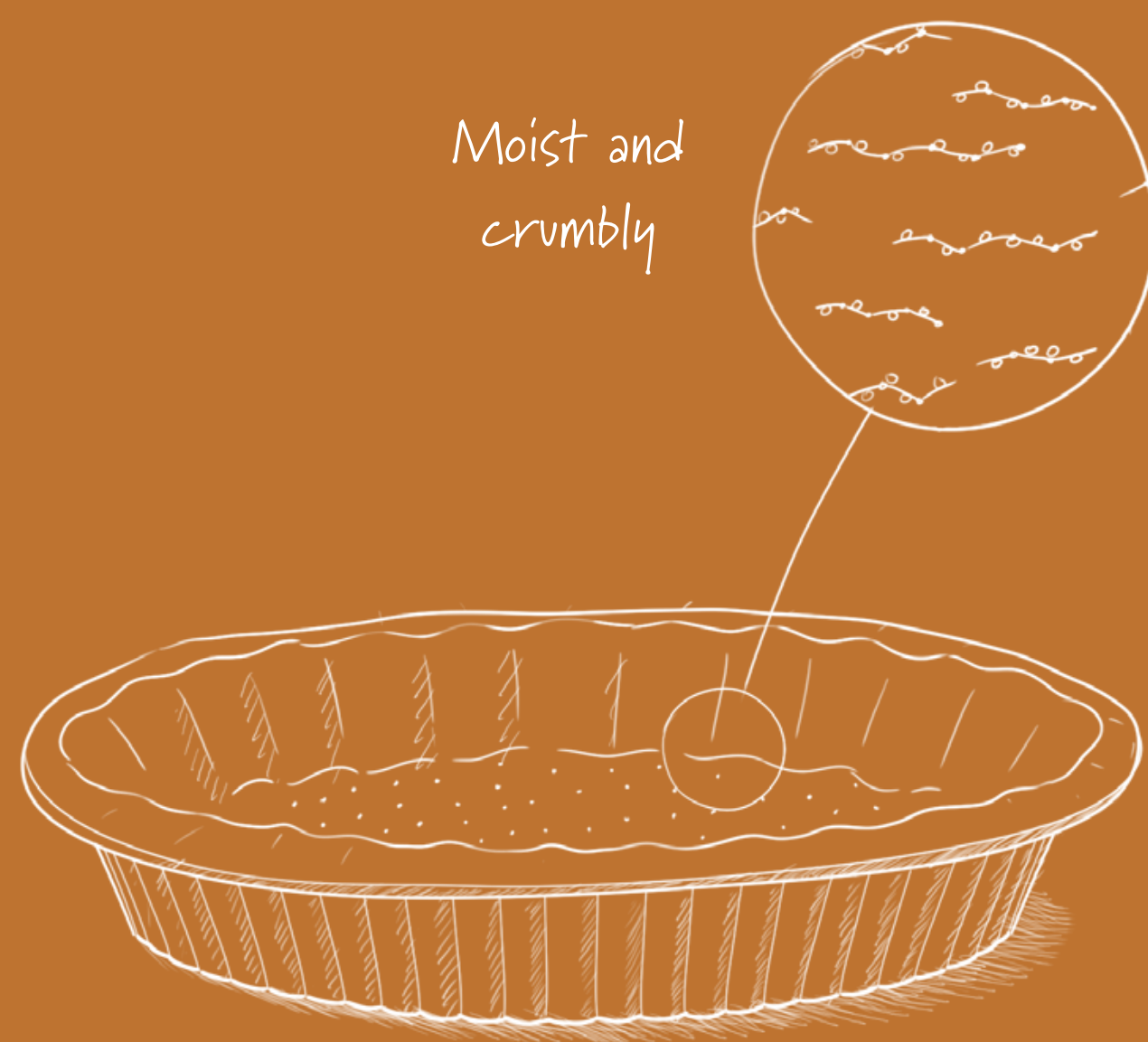
Pastry has tight, unattached gluteins encased in butter