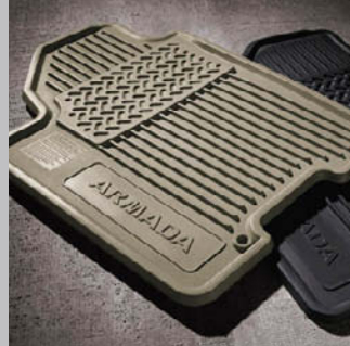
All-season Rubber Floor Mats