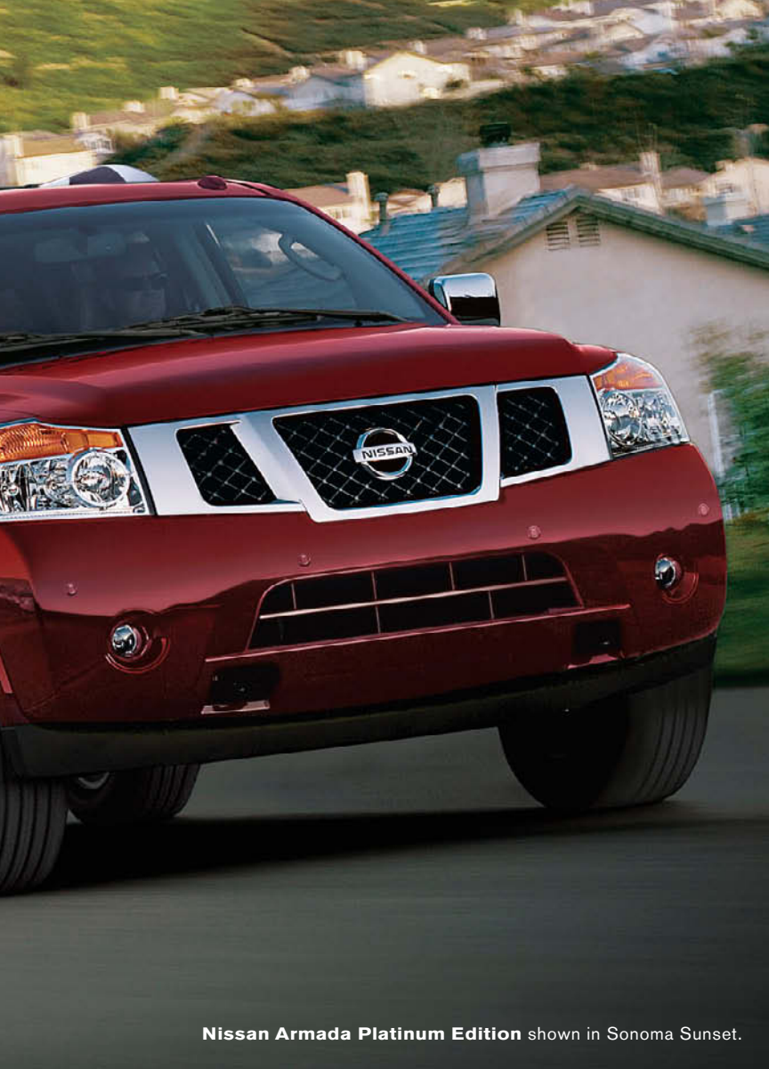
Nissan Armada Platinum Edition shown in Sonoma Sunset.