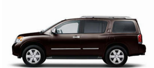
Kona Bean 1,3 CAE