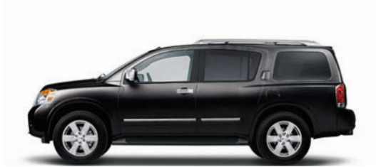
Galaxy 1 G10