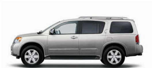
Silver Mist 1 K12