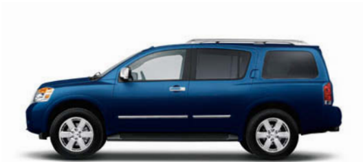
Ink Blue 1,2 RAB