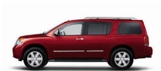
Sonoma Sunset 1 NAD