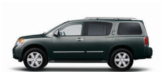
Smoke 1 K11