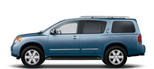
Ocean Wash 1 B30