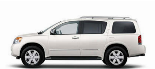
Nordic White 1 Q10