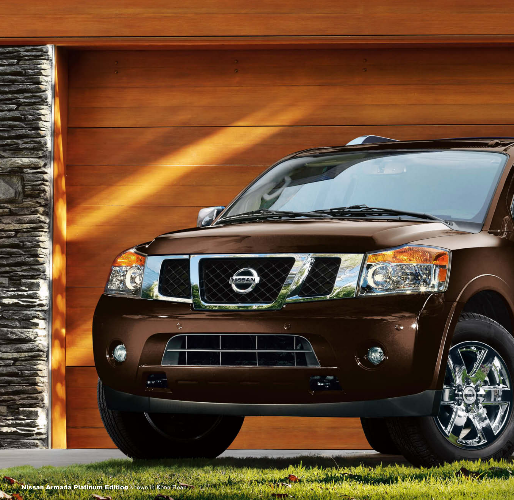
Nissan Armada Platinum Edition shown in Kona Bean.