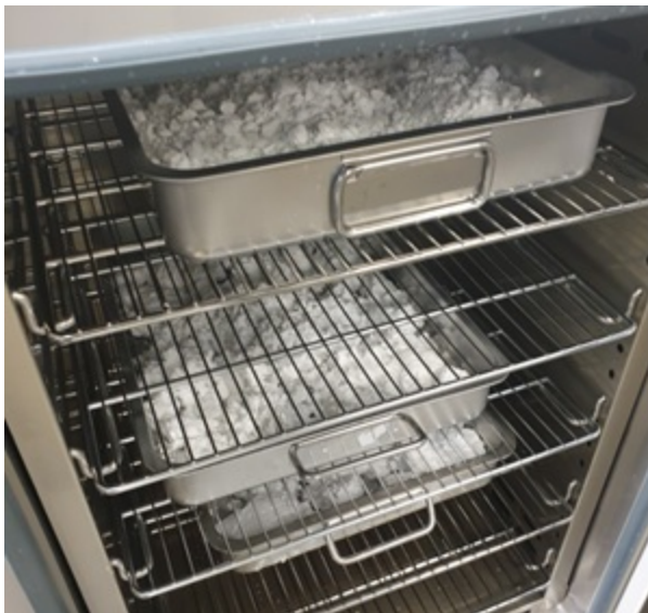
Trays of high purity lithium carbonate produced at the SiFT Pilot Plant in Richmond, BC, Canada, being dried in a controlled temperature oven prior to analysis.